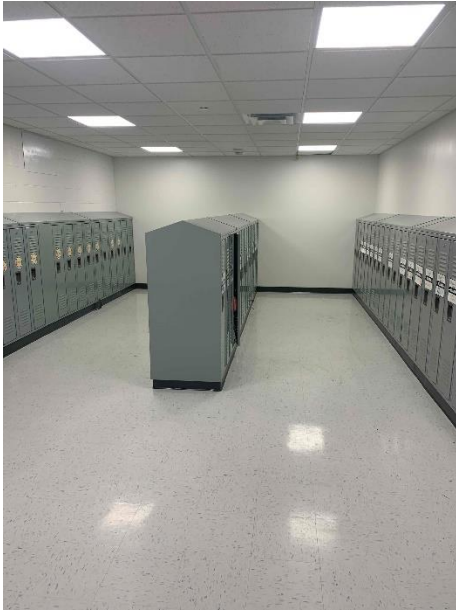
SFES Student Lockers