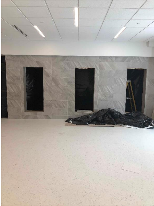
SFMS Cafeteria addition wall tile complete