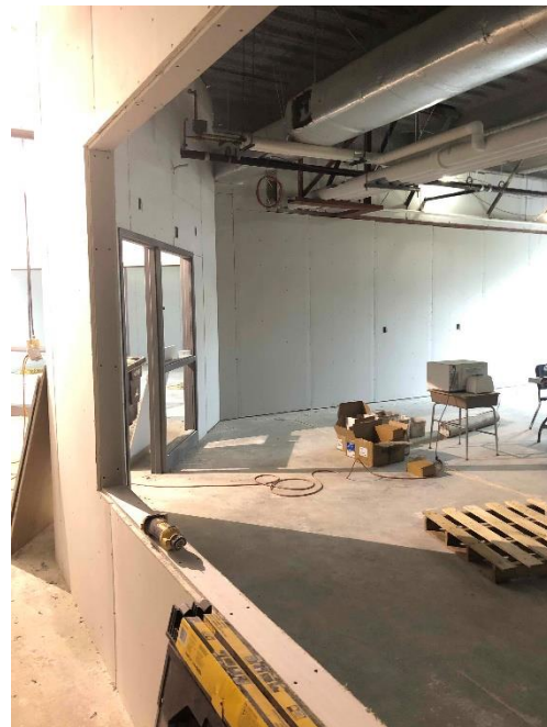
SFMS Lower A Drywall install