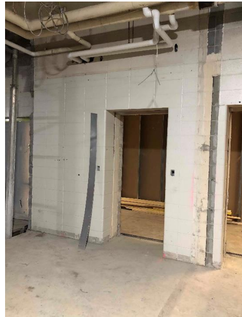
SFHS Band/Choir new door openings prepped for framing