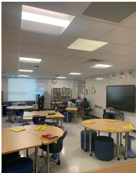
SFES new addition classrooms complete