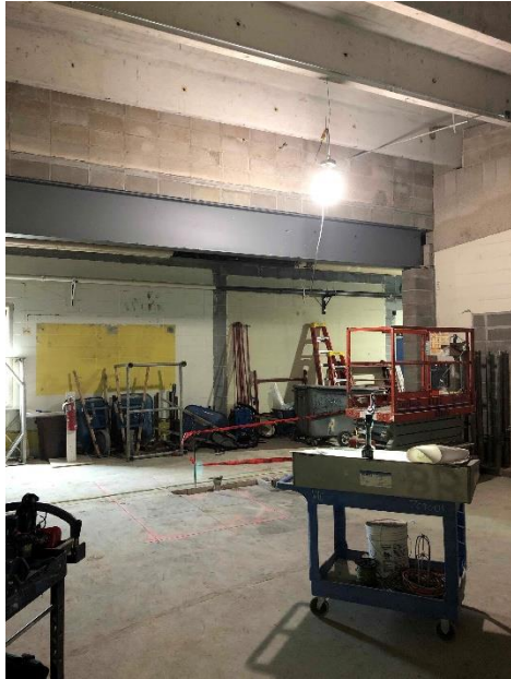
SFHS Band/Choir I beam placed and shoring removed