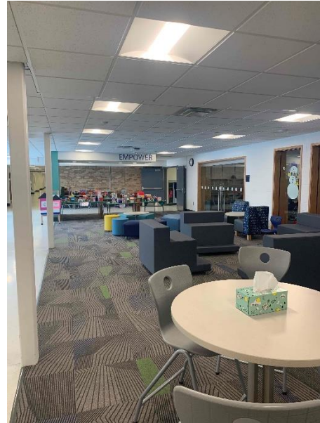
SFES Student Common Area