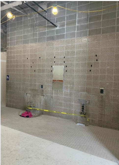
SFMS Upper L Bathroom Demo