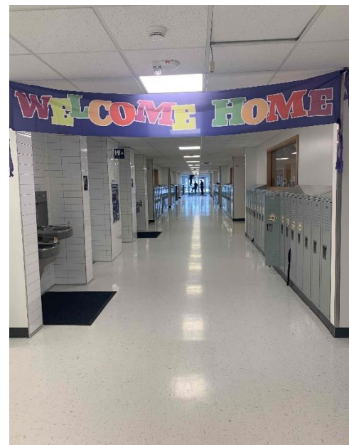
SFES new addition hallway