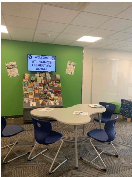
SFES Student Learning Area