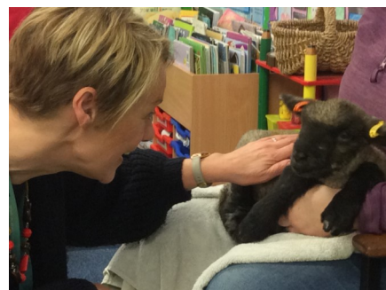
Love at first sight!

A two-week old lamb called Jim visited Year 2 on Tuesday. Jim was helping the children with their Living Things and their Habitats learning in Science. The children asked some fantastic questions about Jim. After the lesson, Jim was returned to his mummy on the farm.