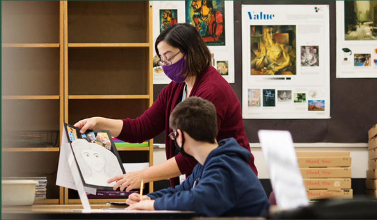
Barre City Elementary & Middle School