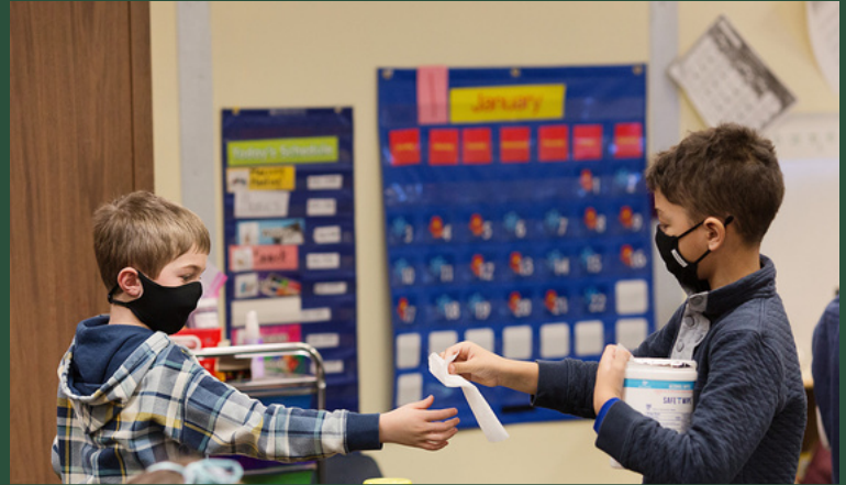
Barre Town Middle & Elementary School