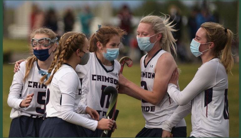
Spaulding High School

Doing whatever it takes to ensure success for every child.