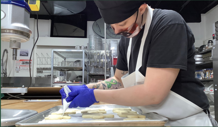
Central Vermont Career Center