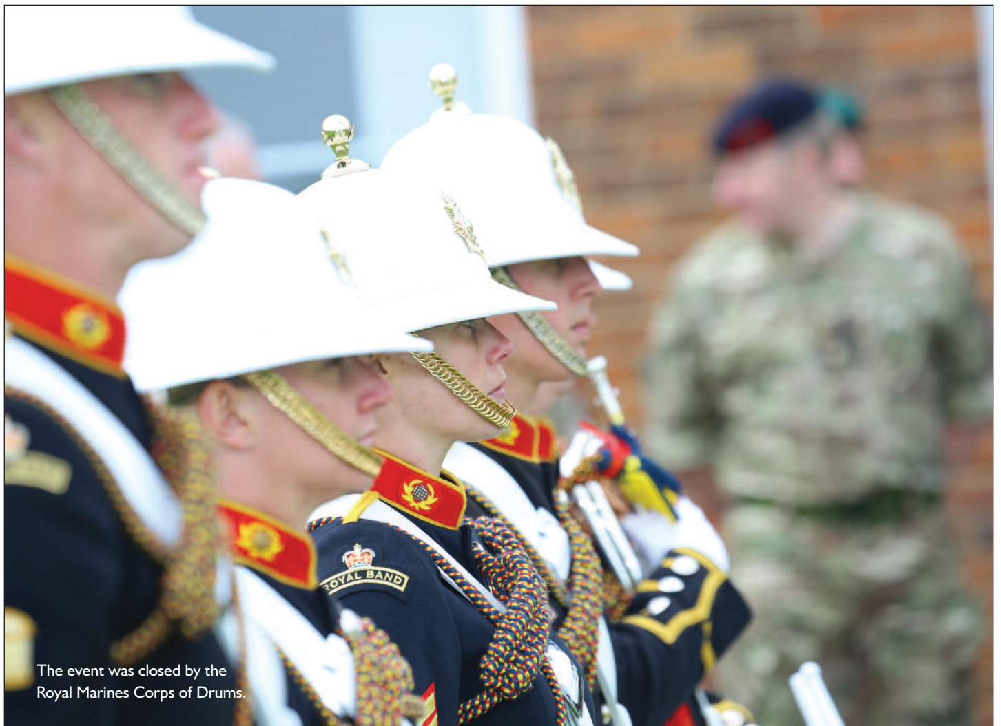
The event was closed by the Royal Marines Corps of Drums.

choose to be a part of it. Dame Allan's had cadet force units over 100 years ago, and I am thrilled to be able to offer it to our students again. Most importantly, what today shows is that partnership and understanding are the keys to success. This cadet contingent shows partnership between state and independent schools, an Anglican School and a Catholic School and a Newcastle and Gateshead School. We are very proud.'