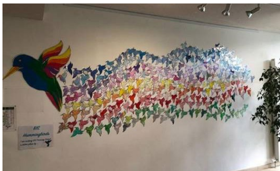
The Hummingbird project at Primary School Haimhausen.

Messages of support and encouragement for 12th graders came from some of their smallest but most fervent admirers as they made their way to exams. During the last buddy reading time Primary students created posters containing personal messages of encouragement for display on the way into the exam hall, "so they will feel a little less nervous as they walk into the room." Primary students were "delighted to unveil our final surprise for the Grade 12 students."