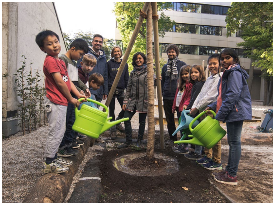
Co-operation with Green City: planting trees programme.