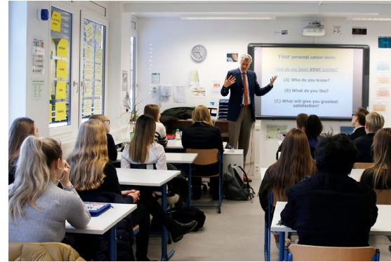
Strong tradition: The 8th Career Day 2019.

With a clear eye to the future for students when they inevitably join the workforce, the BIS Annual Careers Day, started in 2010, has become an important component of the senior school calendar. At this year's event, twelve presenters from the BIS community spoke to students about their careers, their life and work skills and to give hints, tips and inspiration about the 'world of work'. Presenters included corporate CEOs and VPs, a Business School Academic Dean, a design engineer, social worker, dentist, senior researcher, astronomer and sustainability consultant. Students visited four sessions each and had the opportunity to ask questions and could join the guests after the event over a networking lunch.