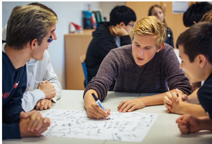
Teamwork & Design Thinking at BIS.

“Schools need to be more digital,” they said, “flexible and individual...more innovation and experimentation rooms...an Internet portal for easier appointment coordination between teachers and students.” Students also created a “New Student Voice” that aims to provide better teacher feedback through monthly surveys, open classrooms to increase transparency and group work, and requested less rote learning, more hands-on problem solving.