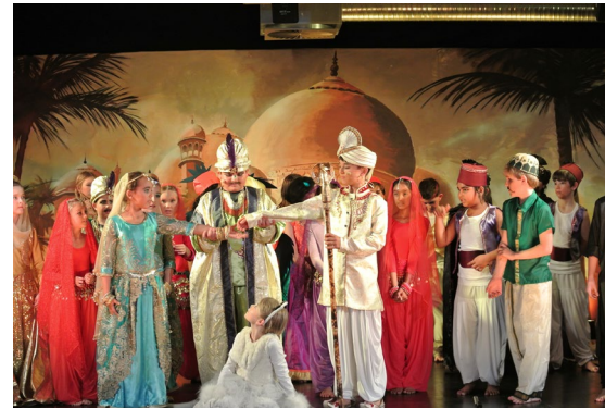
Great performance: Aladdin production at City Campus.

Performance of 'Aladdin' by the Grade 3-5 ASA Production Students: Aladdin, Princess Jasmine, the Sultan of Agrabah and, of course, the Genie came to life most colourfully thanks to the talents and hard work of City Campus Grade 3-5 ASA production students. The production provided "a great opportunity for the students to express themselves in a creative and joyous environment," said a production leader from Haimhausen Campus. "It takes an amazing team effort, time, dedication and skill to create such a production," which featured great acting, spectacular singing, amazing dancing, stunning costumes and scenery. "So well done on this fabulous performance!"