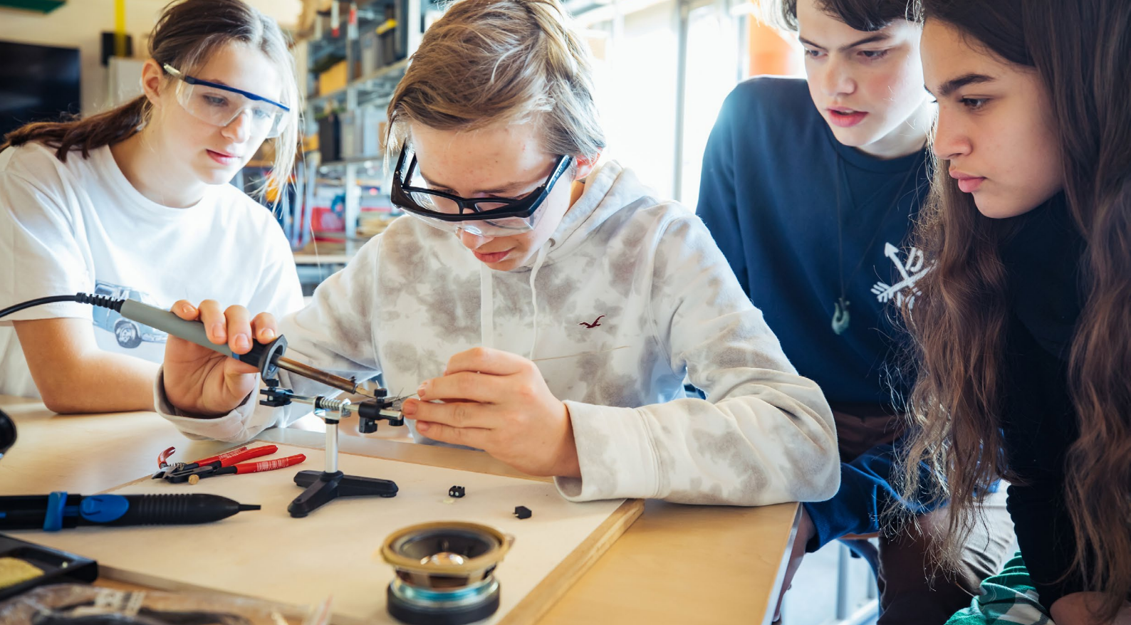
An important element of the pedagogical programme at BIS: Design Technology.