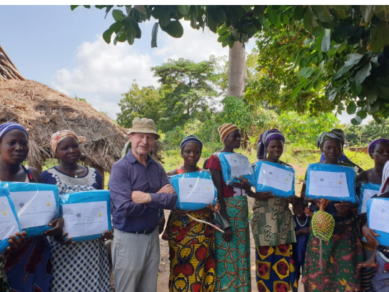
Charity initiative for Freunde Benin e.V.