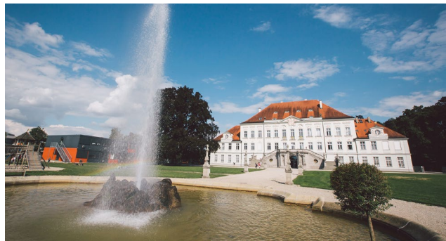
Place to learn: The Bavarian International School with two campuses in Munich-Schwabing and Haimhausen (photo).