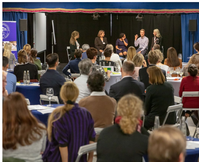
More than 100 guests attended the event at City Campus.