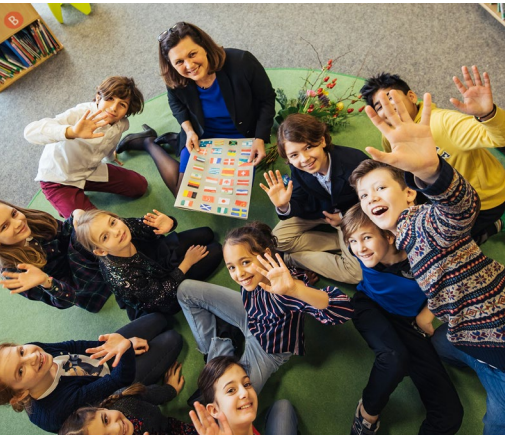
Ilse Aigner with Grade 5 students at City Campus.

“It was great fun to read and discuss with the BIS students. They were very friendly, curious, bright and confident. You can see that BIS is a truly international school – internationality, diversity and open-mindedness can be felt in every hallway, in every classroom. I also like the fact that children learn at a very early age to work together and help each other, and that the latest technology is sensibly integrated“.