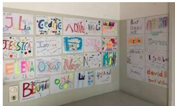
Lovely messages from Primary School students for the Grade 12 students.