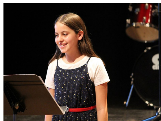
To be continued: The Hear My Voice-Festival 2019.

Through poetry, short stories, visual arts, acting, writing dramatic scenes, musical composition and performance, 176 Grade 6 and 7 BIS students from 37 nations participated in the "Hear My Voice Festival" at Haimhausen. Formerly called "Poetry Evening" the event was expanded to include a greater variety of media so that students could express themselves in unique ways about the things that truly matter to each of them.