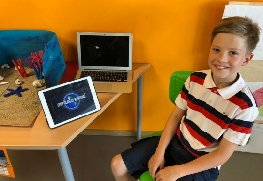
“Believe. Inspire. Succeed” : The Grade 5 Exhibition.