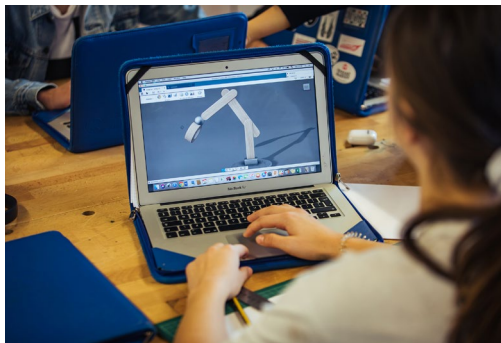
State of the Art: Design Technology.