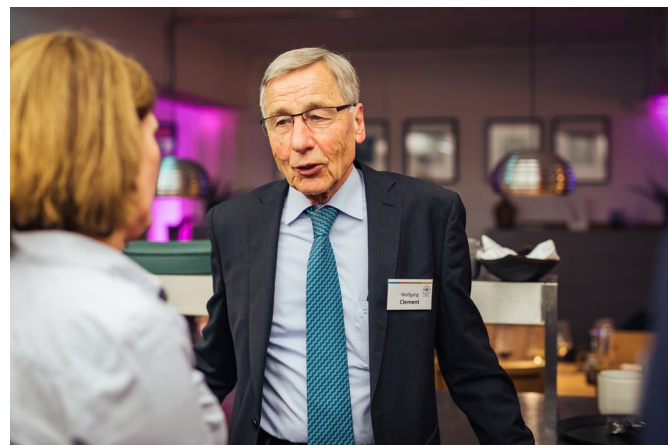
Wolfgang Clement in conversation.

“The pronounced self-confidence that the children are developing at BIS is what impresses me most. The school’s personalized approach to each child in the classroom, combined with the genuine attention paid to each one as an individual with a unique character, is preparing the children to go into the world self-confidently, fully capable of presenting their own thoughts in front of any audience.“ Wolfgang Clement, Former Federal Minister of Economics