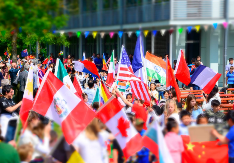
The highlight of all PTO events: The International Festival.

The Culture Club provided monthly opportunities to explore and learn more about our host country, Germany.