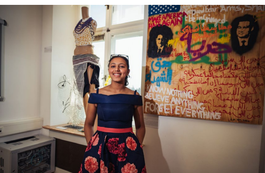
Great success: the Art Exhibition 2019.