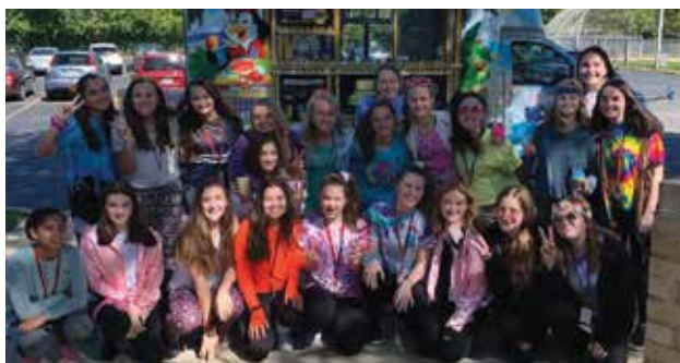
Thanks to the Resurrection Student Council, students enjoyed a visit from a Snow Cone Truck during the September 2019 Spirit Week celebration.