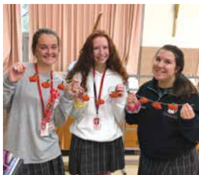
Members of the DIY Club welcomed the month of October with a festive craft activity during their club meeting.

Resurrection offers over 40 clubs and activities that encourage students to explore new academic interests, demonstrate leadership, develop healthy, lifelong habits and create lasting friendships.