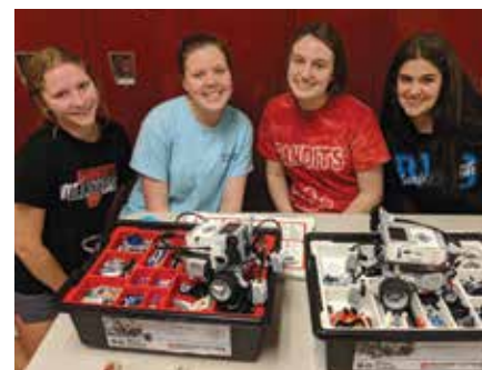
Science National Honor Society members participated in a STEM event at John W. Garvy School in May 2019 by introducing younger students to robotics.