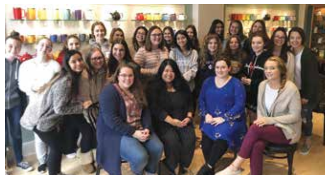
The Resurrection Teology Club is new this year and meets before school to discuss topics of faith while enjoying tea and treats together. In October 2019, members ventured to TeaLula in Park Ridge for a field trip after school and enjoyed a tea tutorial.