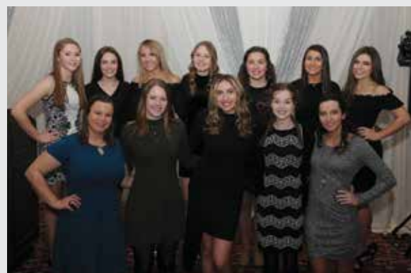
Resurrection students acted as ambassadors at the Gala