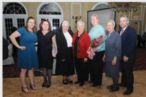
Dreams to Reality Award presented to The Madonna Foundation