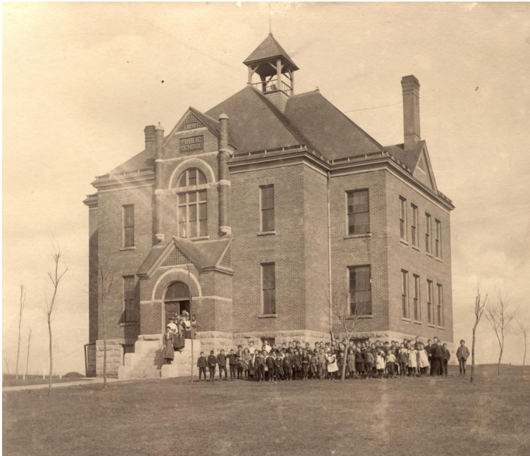
Montgomery School opened 1891 1903 photo