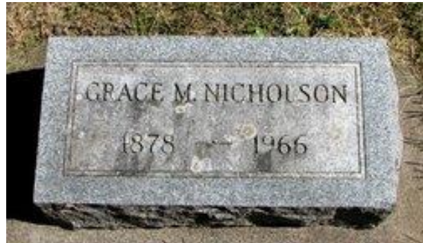
West Aurora Cemetery