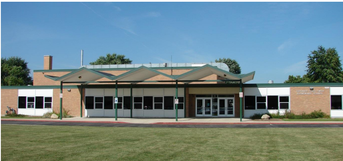
Gertrude Scott Smith Elementary School 1332 Robinwood Drive, Aurora Constructed 1963