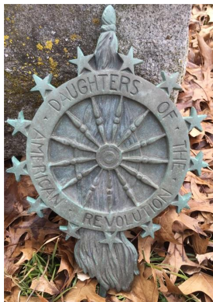
Daughters of the American Revolution (Plaque affixed to Smith's gravestone)