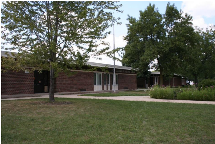
Lucia Goodwin Elementary School 18 Poplar Place, North Aurora Constructed 1968