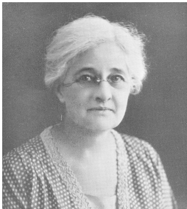
EOS 1936 – Dedicated to Lucia Goodwin