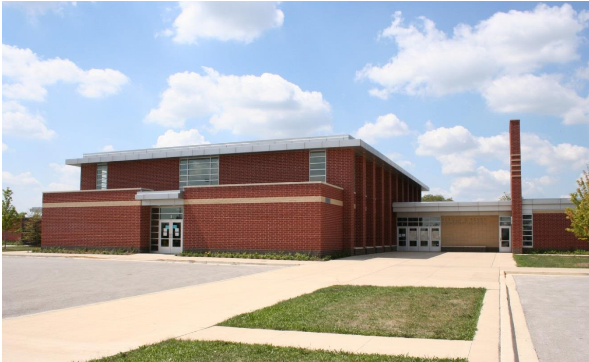
Harold G. Fearn Elementary School 1600 Hawksley Lane, North Aurora Opened 2001