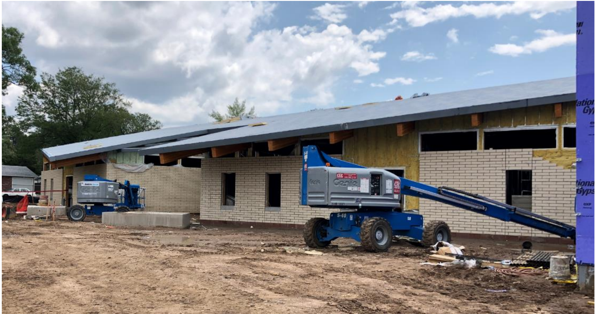
Northeast exterior brick.