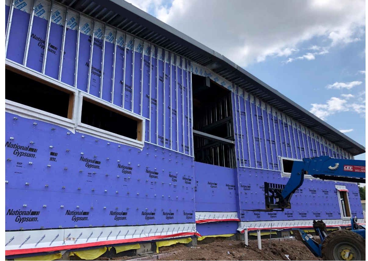
East side brick & West side framing.