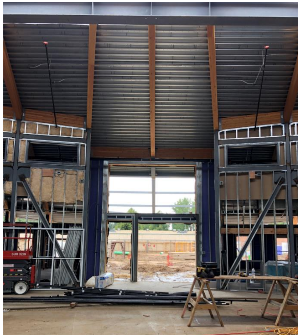
Classroom soffits (left) view of playground entrance (right).