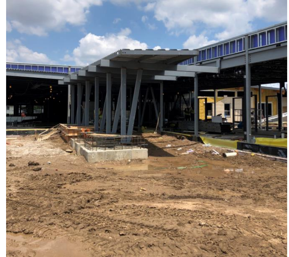
Main entrance area.