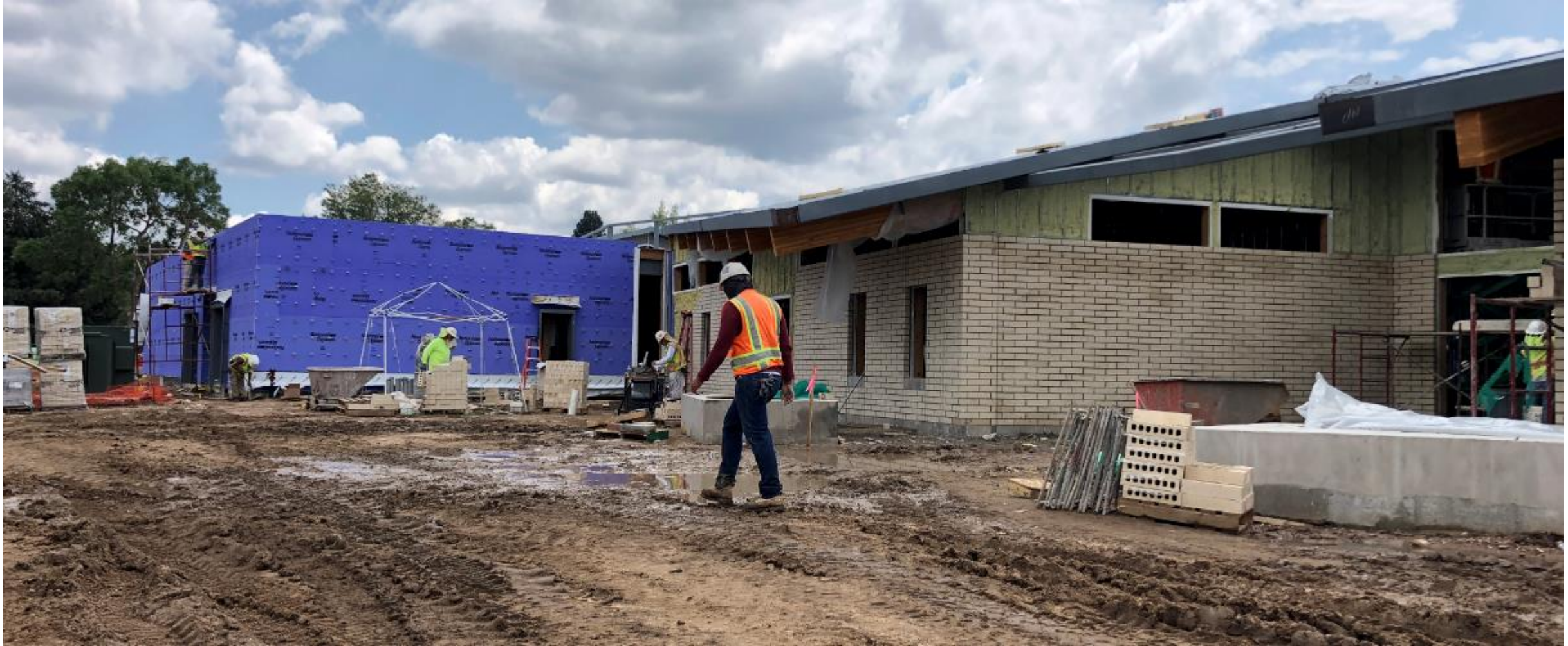
Exterior brick & brick ties on North side.