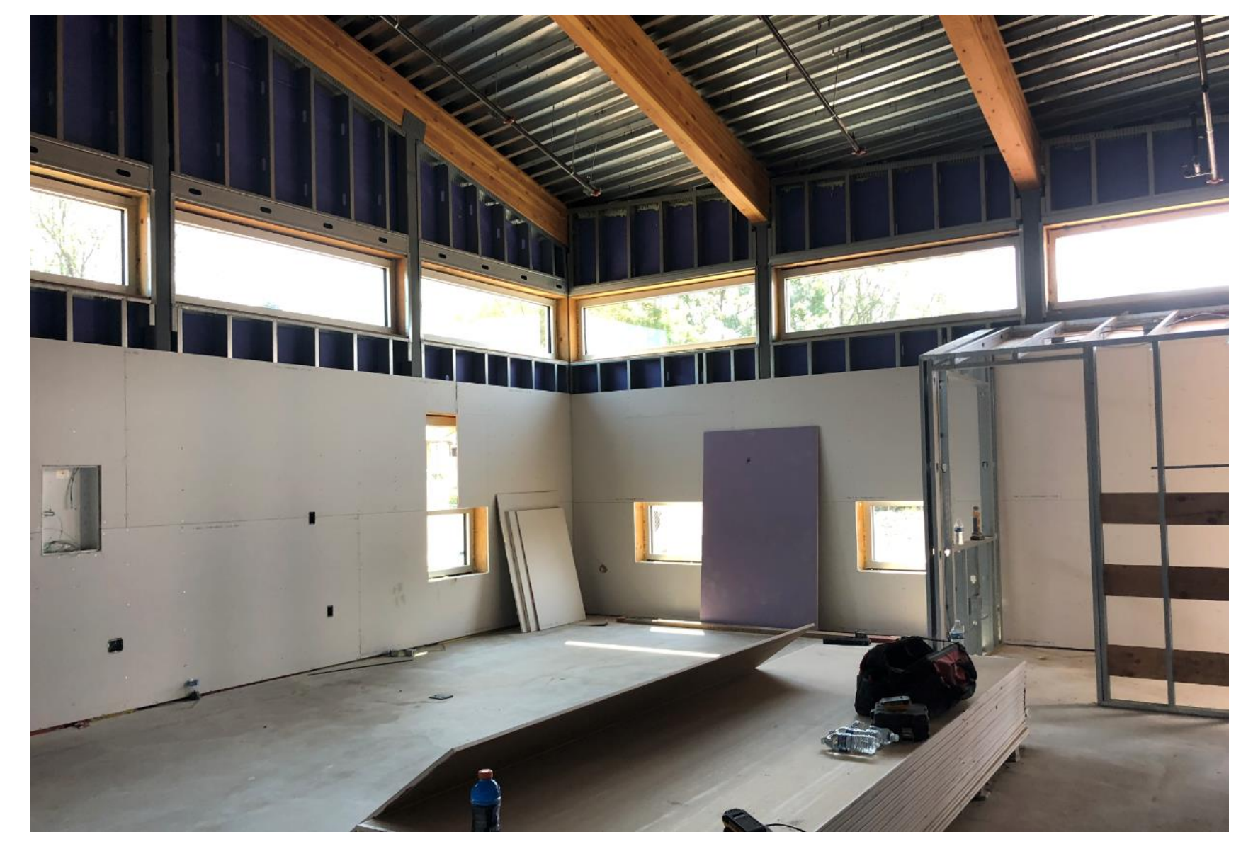
East wing Classroom.