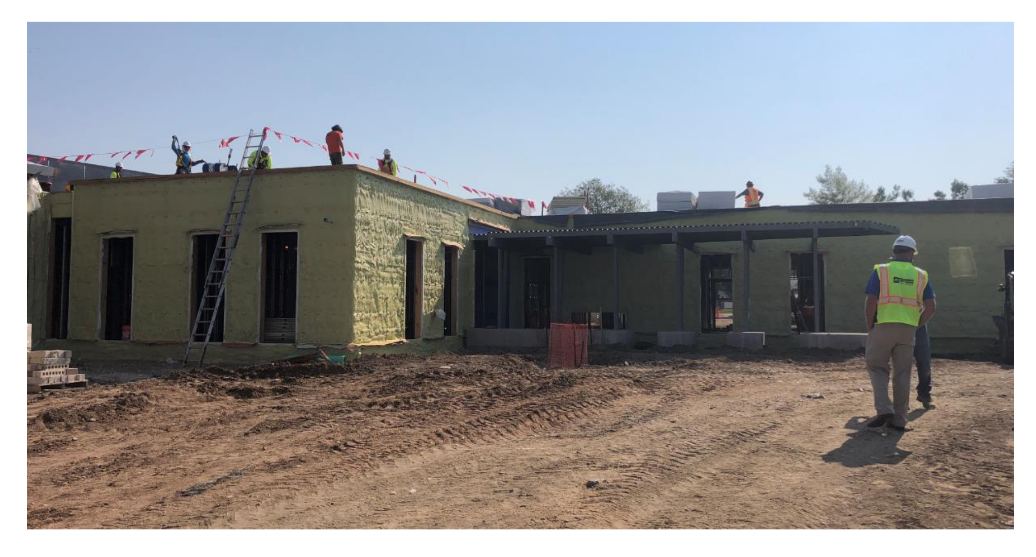
Main Entrance Area.