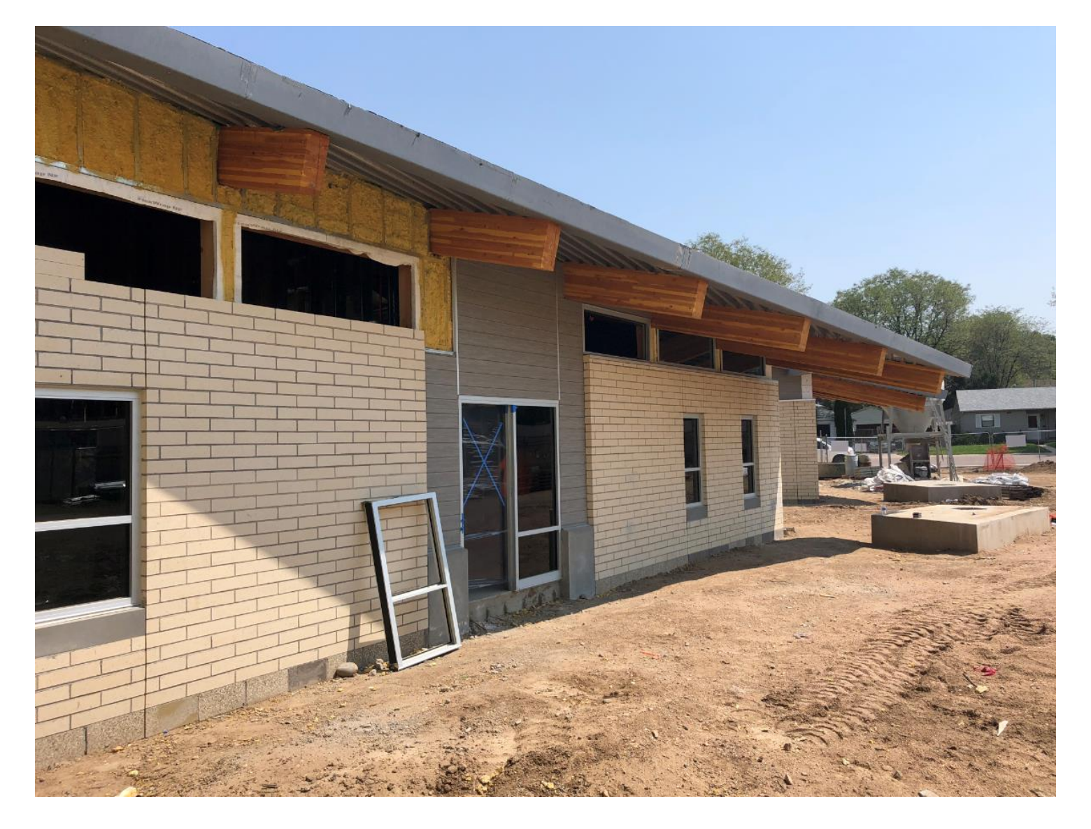
East wing exterior.