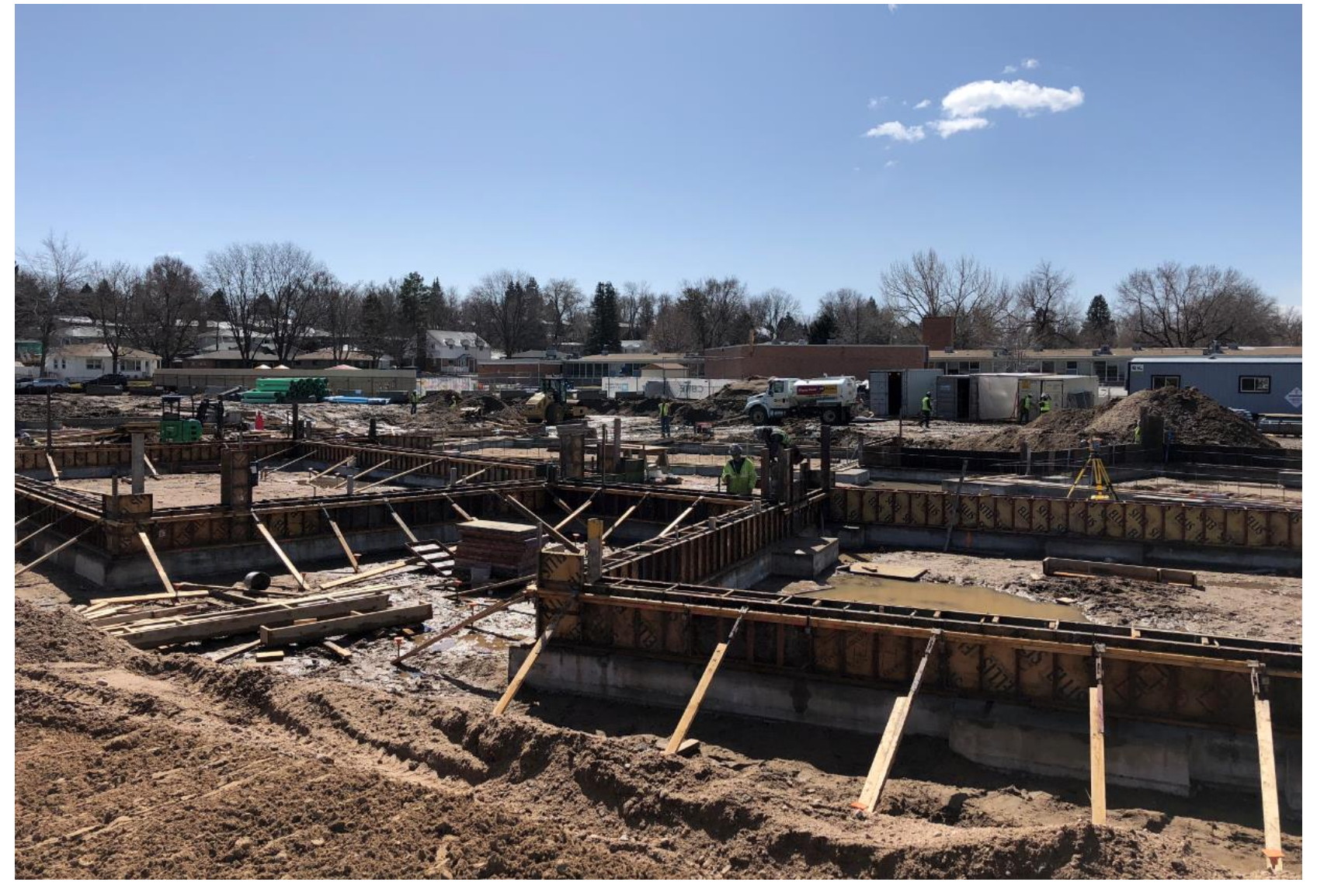
West Wing stem wall forms.