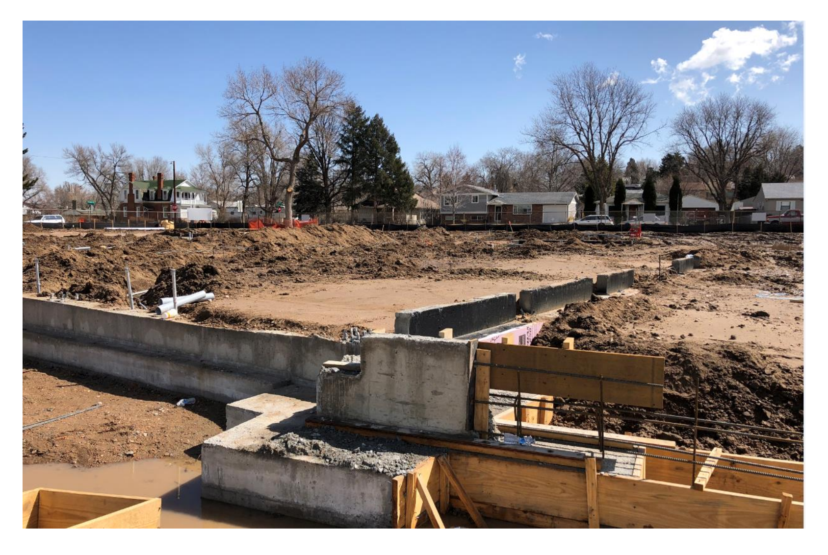
East wing backfilled.