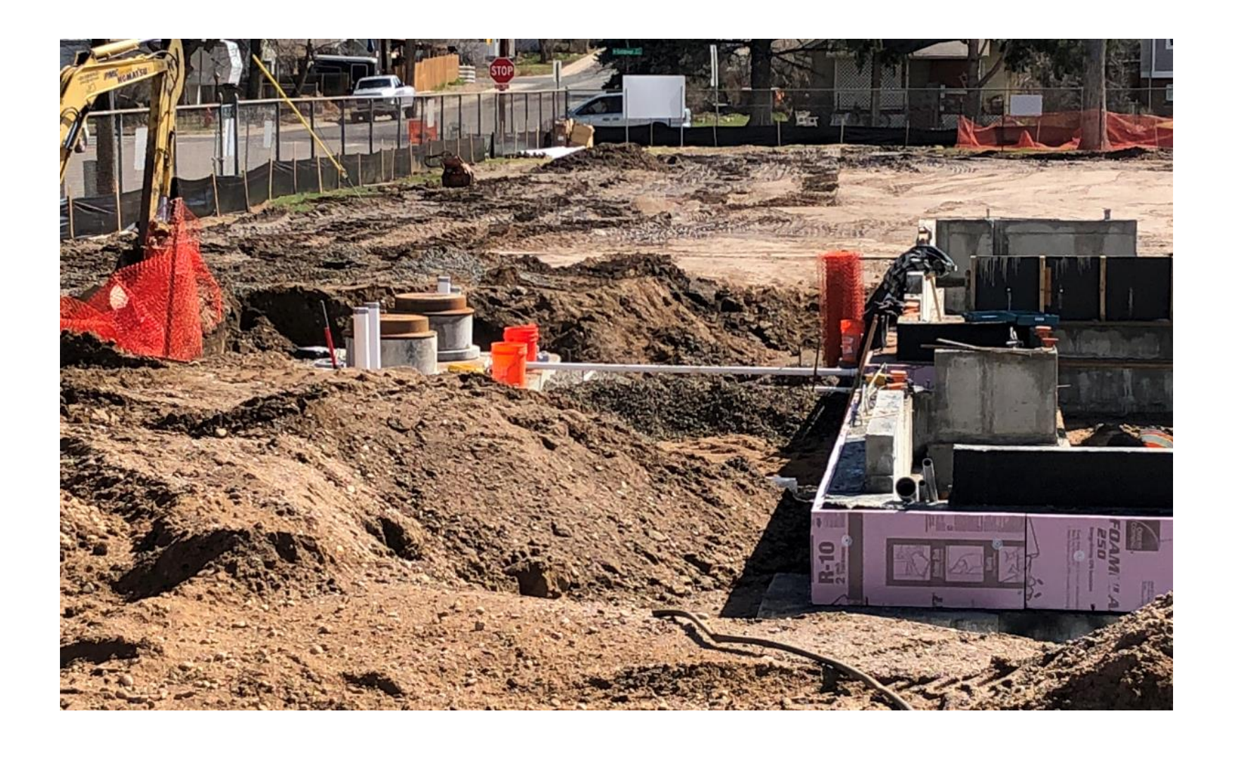
Backflow preventer installed at Central North.