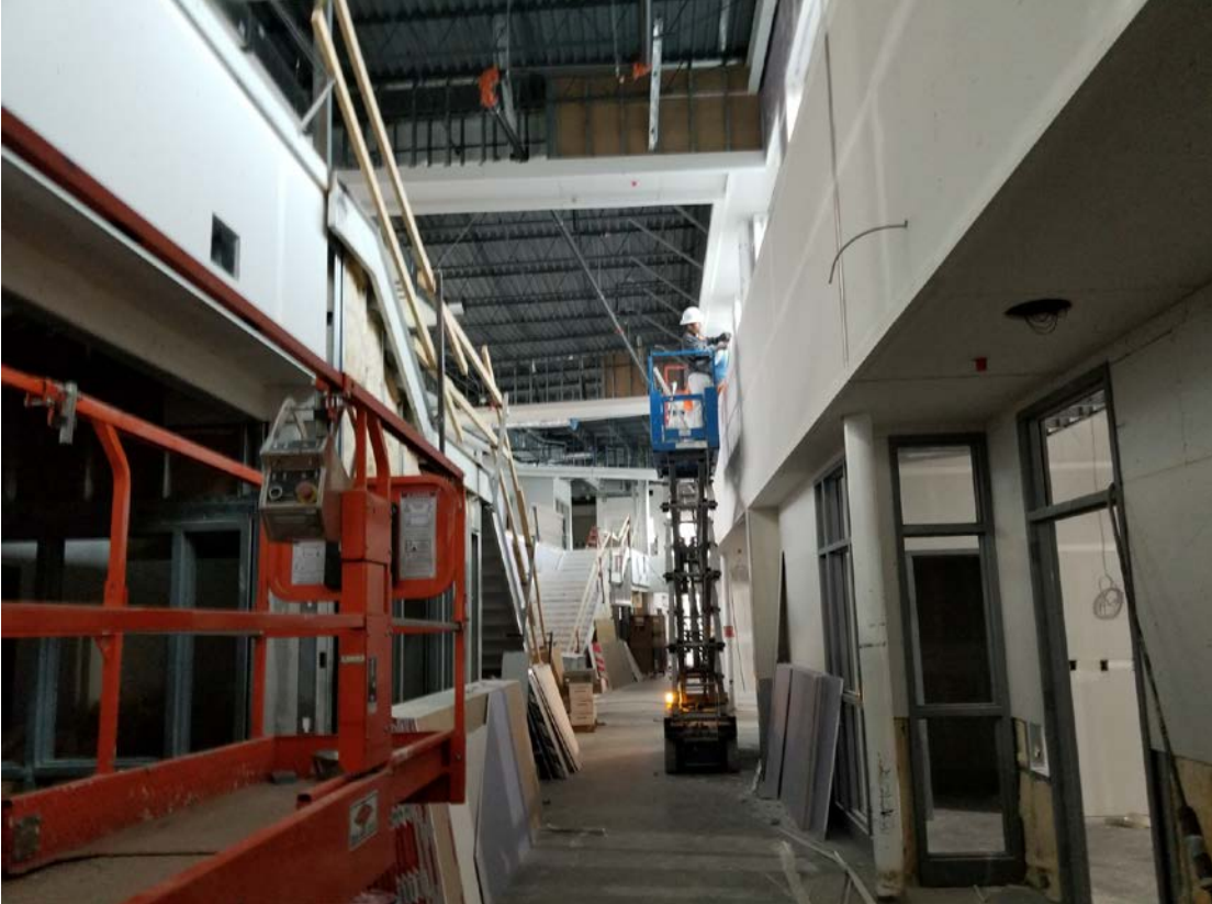
Grand Hall – North Facing View; HVAC, electrical, and drywall install continues.