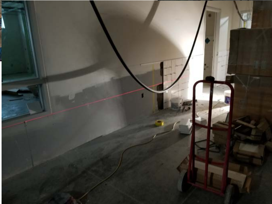
North Classroom Wing (lower level) – Wall tile install continues.