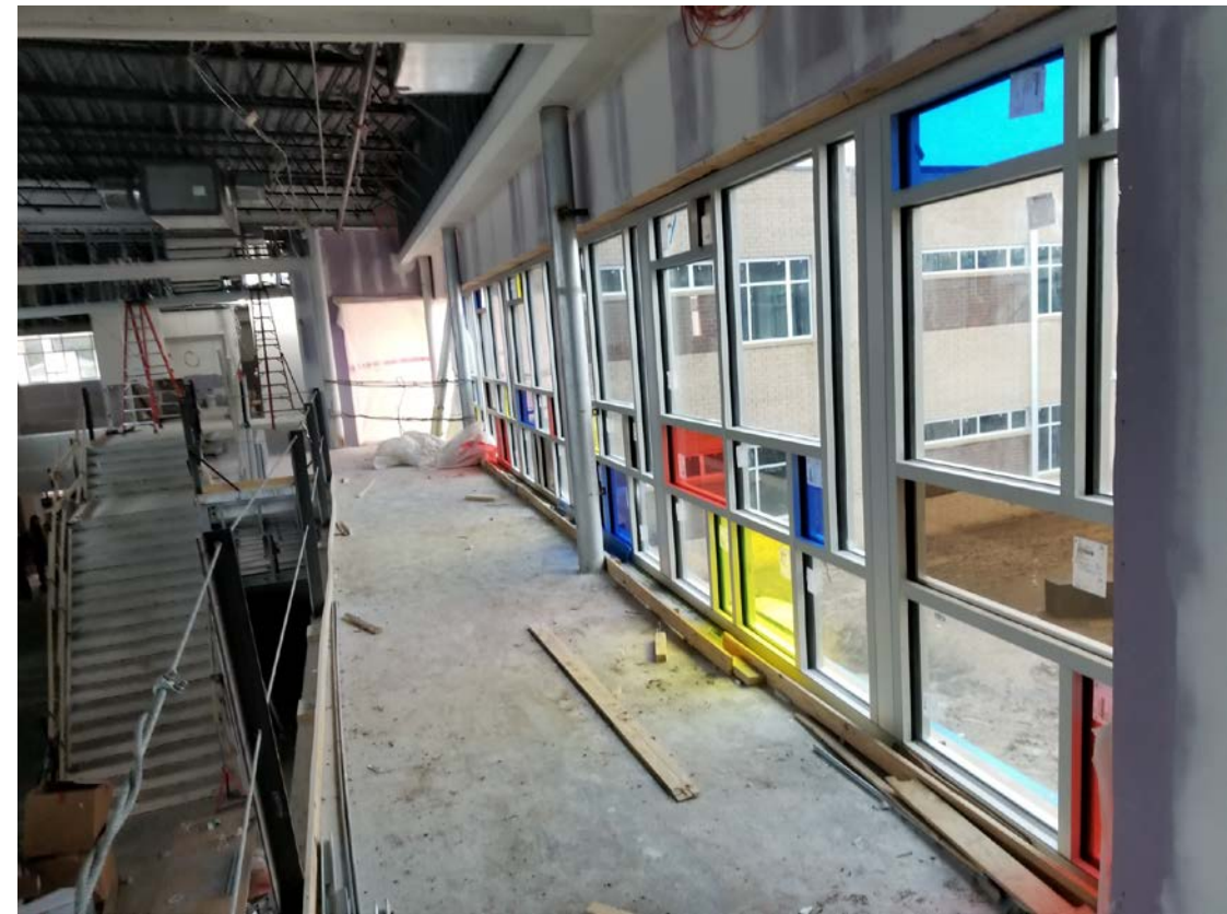
Grand Hall – South Facing View; 2 nd Floor windows newly installed.