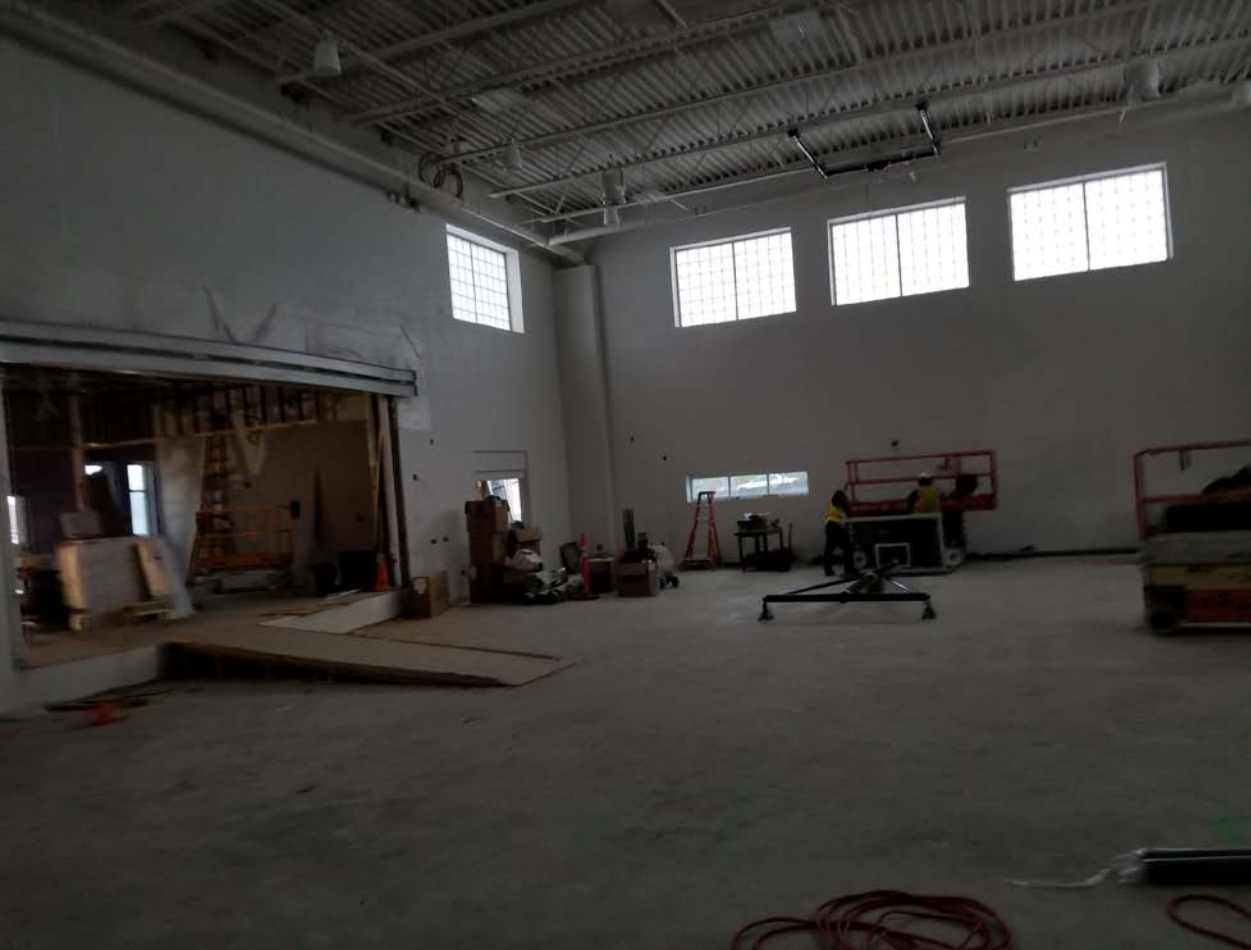
Gym – Painting in progress. Stage currently framing for drywall.