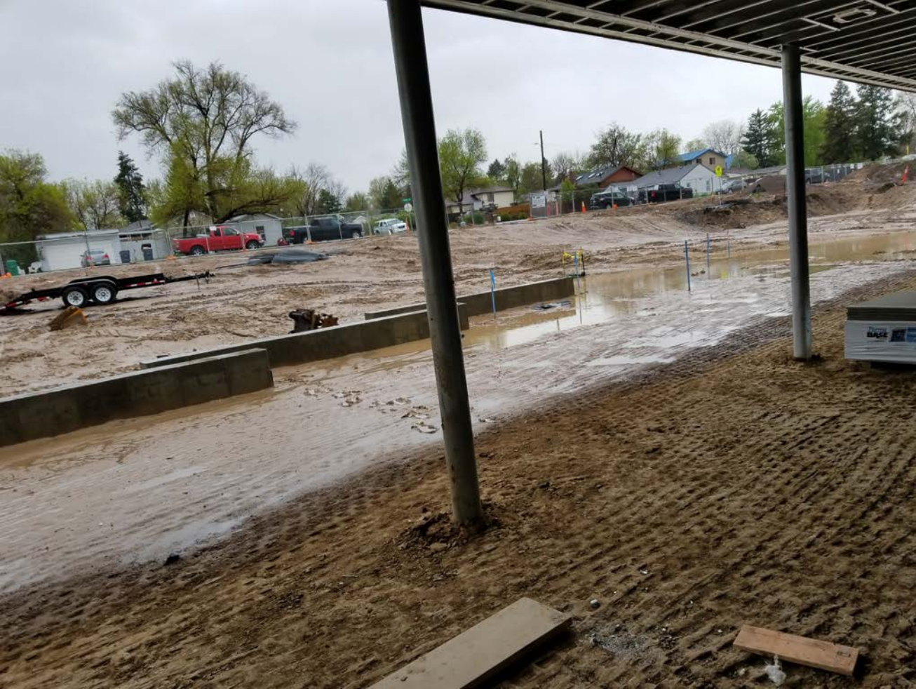
Front Entrance – South Facing View; Sitework continues.