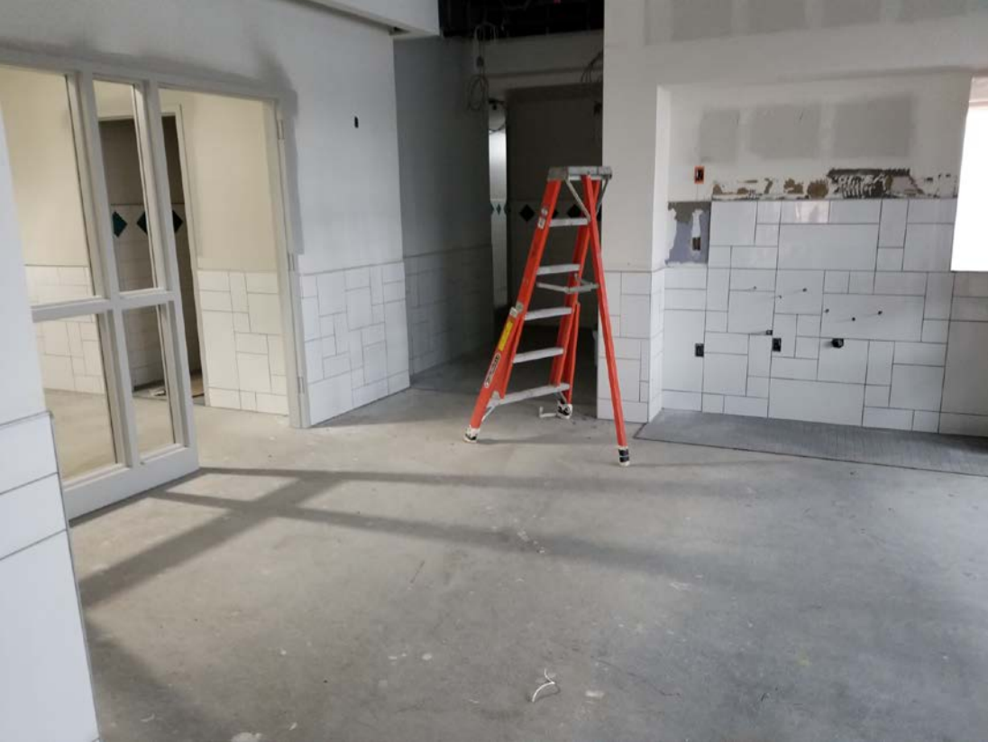
North Classroom Wing (upper level) – Wall tile install continues.