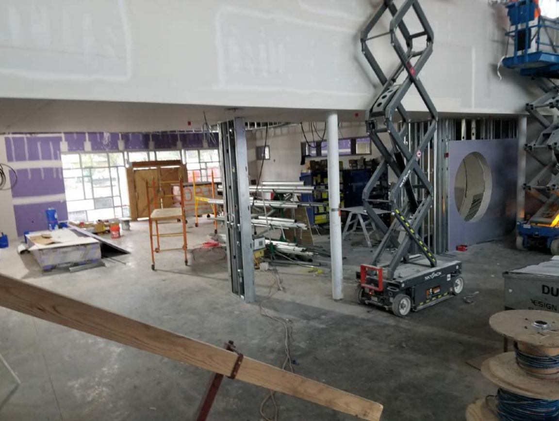
Learning Commons –Drywall install continues.