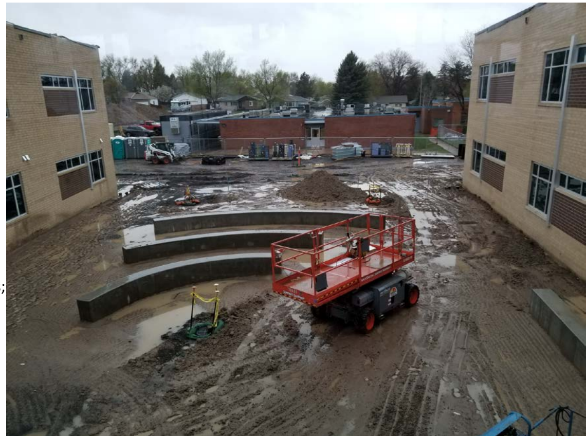
West Elevation – Plaza Between Classroom Wings; Sitework continues.