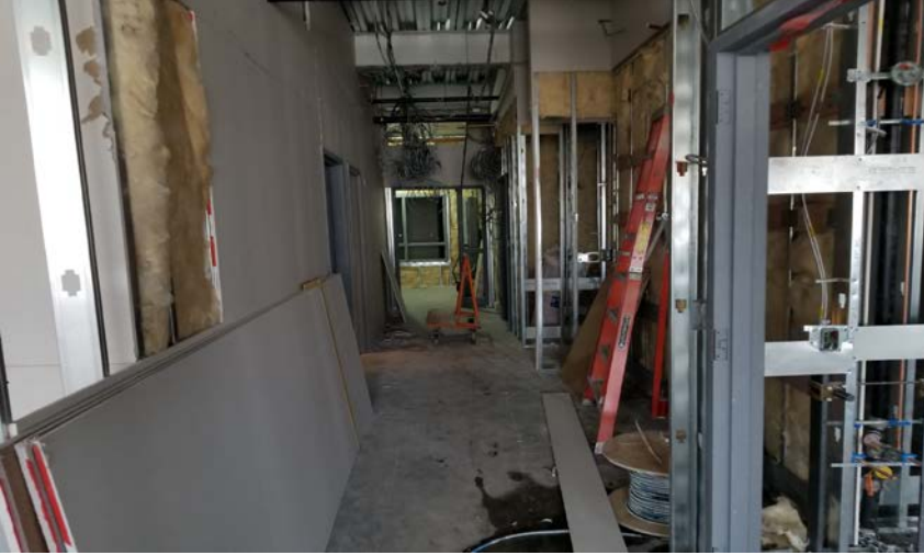
Office Area – Electrical, mechanical, insulation, and drywall install continues