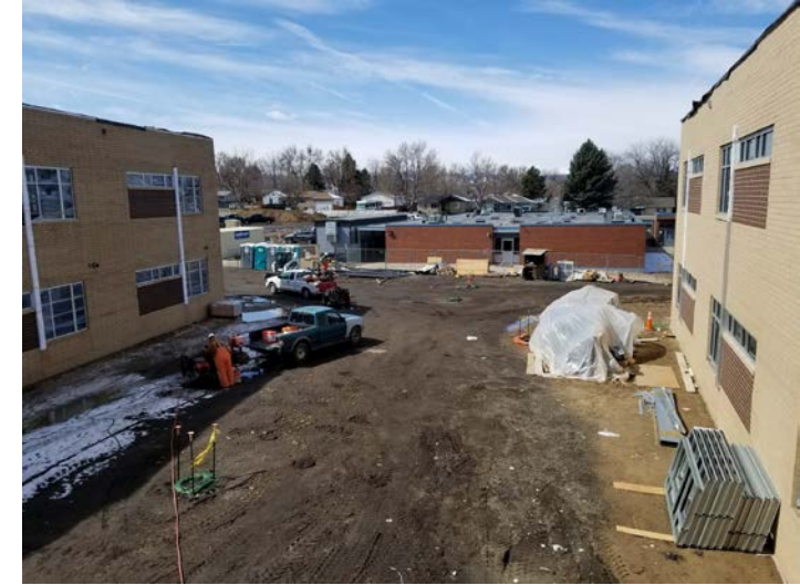
West Elevation; Brick, windows, and frames install continues