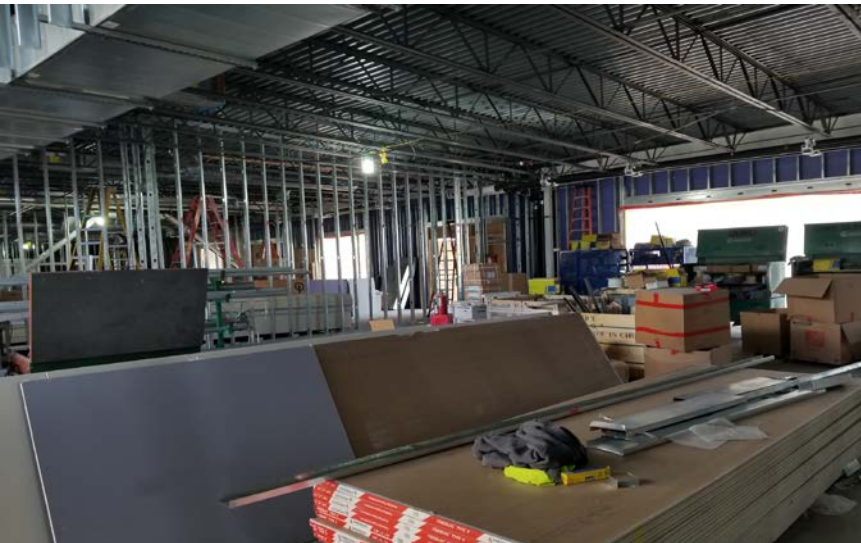
Learning Commons – North Facing View – Framing install continues