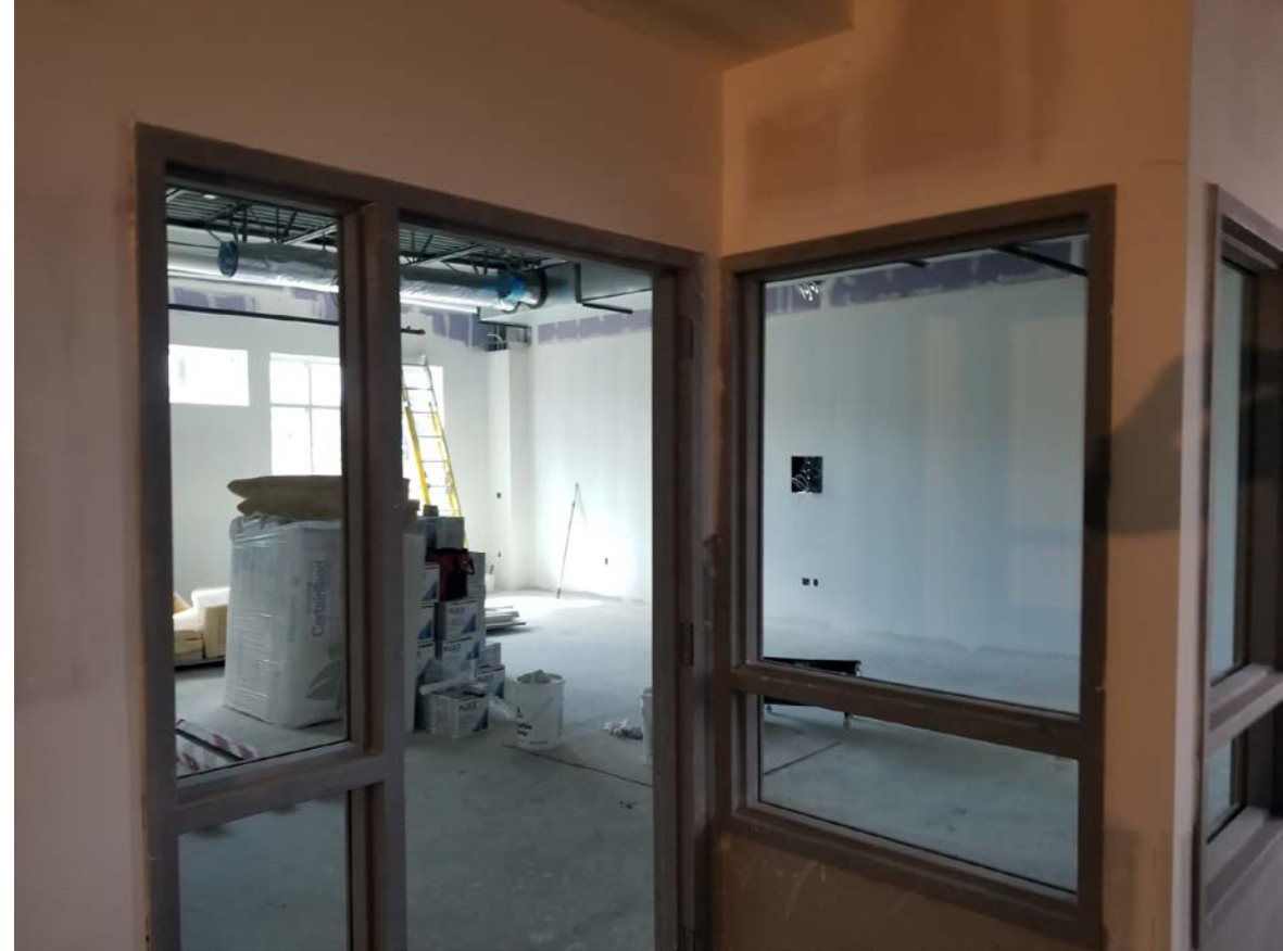
North Classroom Wing (upper level) – West Facing View; Painting to begin soon