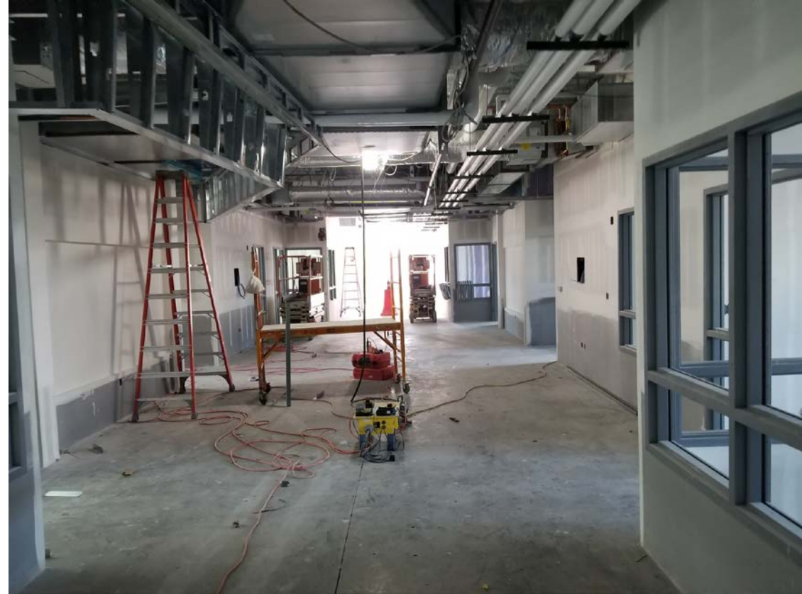
North Classroom Wing (lower level) – West Facing View; Framing and drywall of soffit continues