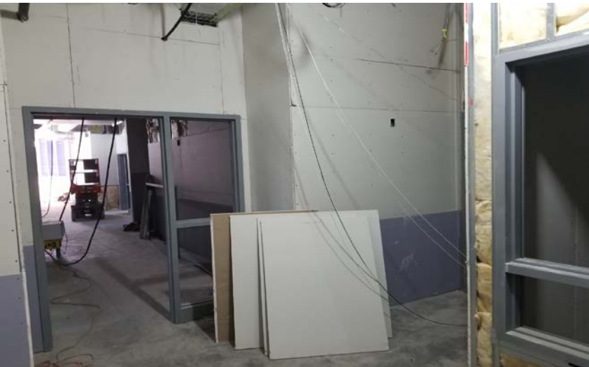
South Classroom Wing (lower level) – West Facing View; Insulation and drywall install continues