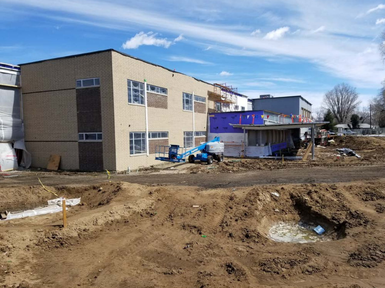
Front Entrance / Gym – Southeast Elevation; Brick, windows, and frames install continues