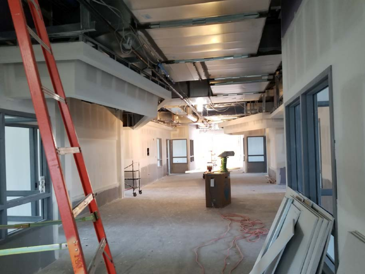
North Classroom Wing (upper level) – West Facing View; Drywall for soffit finishing, painting to begin soon