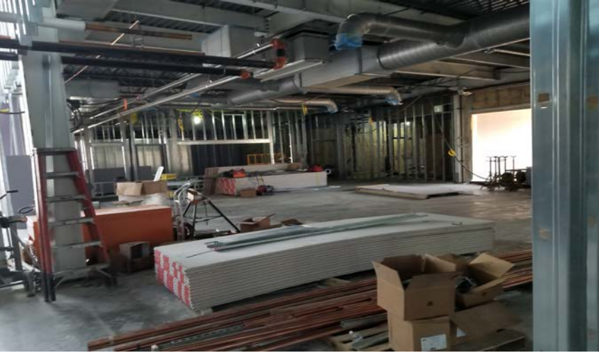
Kitchen and Cafeteria – North Facing View – Framing and insulation install continues