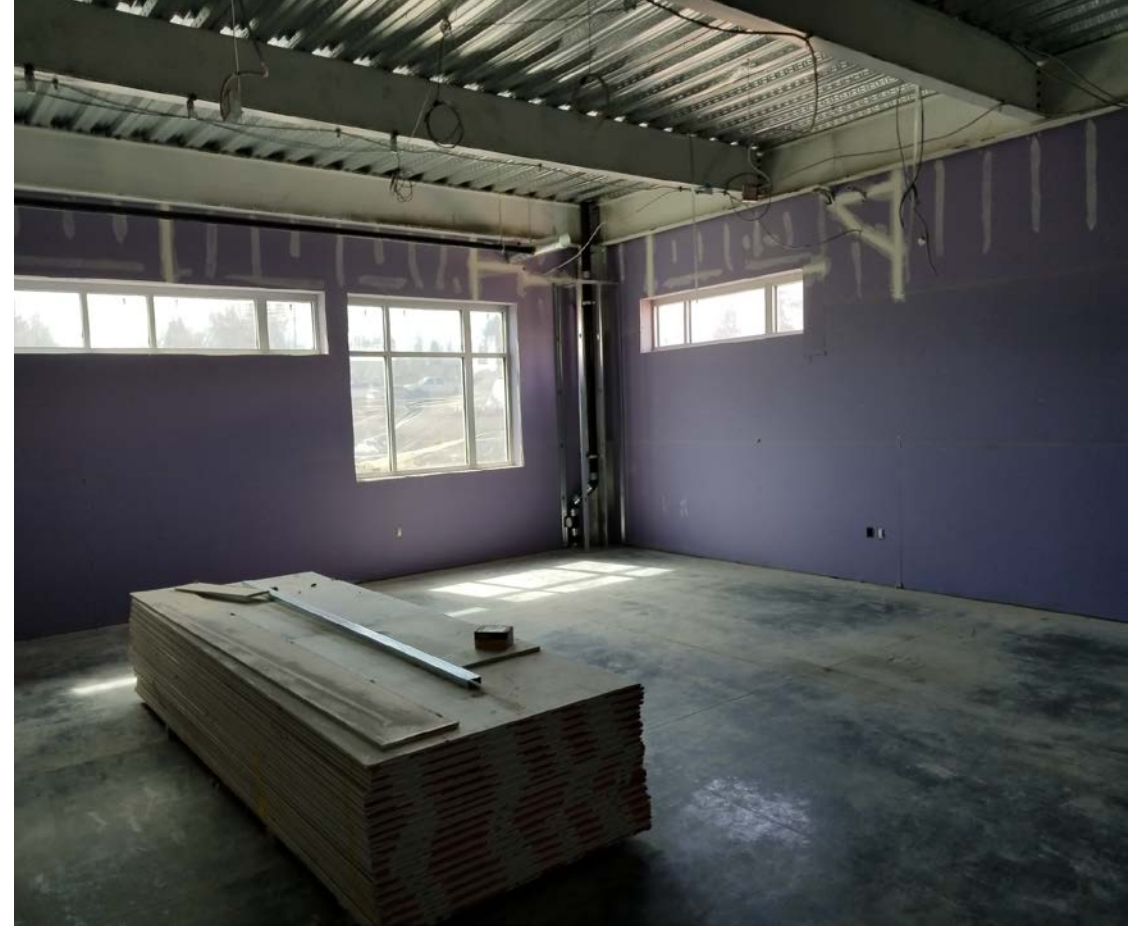
South Classroom Wing (lower level) – Classroom; Painting to begin soon