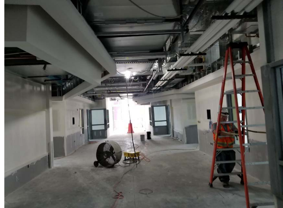
North Classroom Wing (lower level) – West Facing View; Framing and painting continues