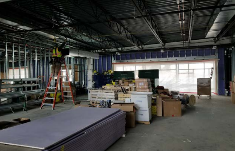
Kitchen and Cafeteria – Framing and insulation install continues