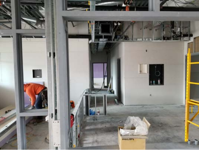
Office Area – Electrical, mechanical, insulation, and drywall install continues