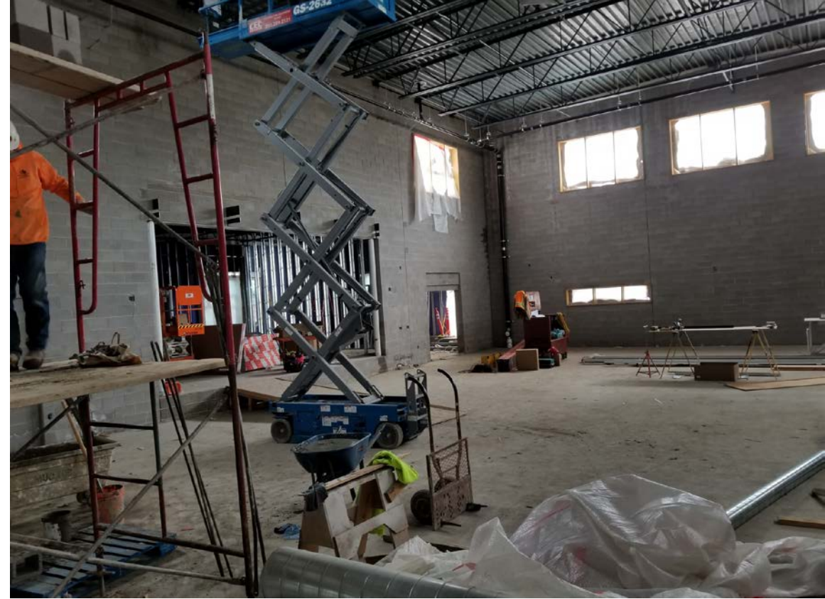
Gym - Mechanical work continues