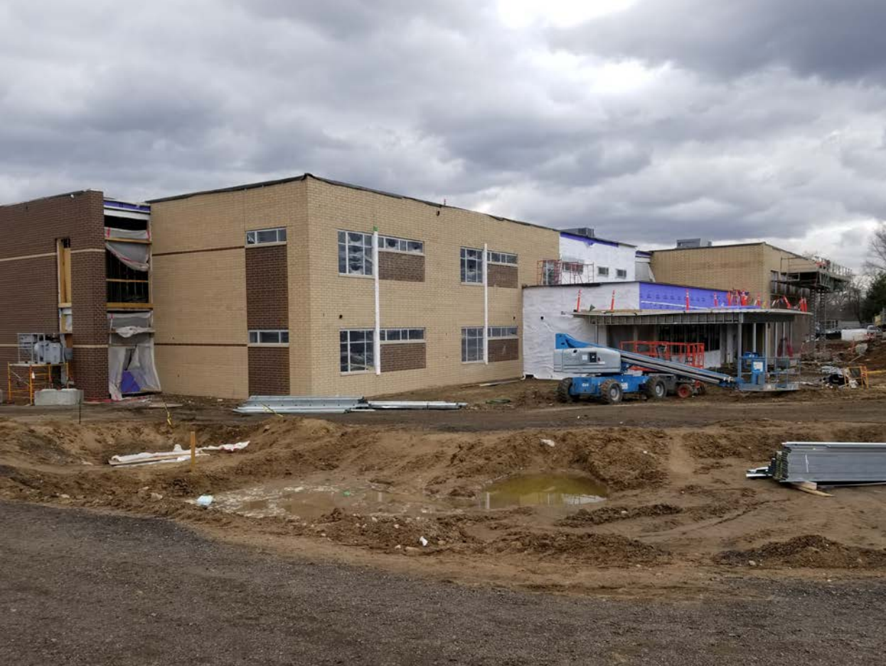
Front Entrance – Southwest Elevation; Brick, windows, and frames install continues