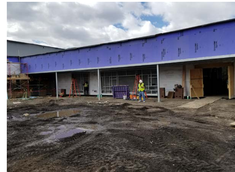
East Elevation; Brick, windows, and frames install continues