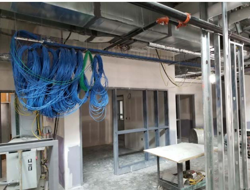
North Classrooms Wing – Conference Room – Data cabling being installed