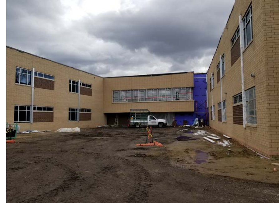
West Elevation; Brick installed. Windows and frames install continues