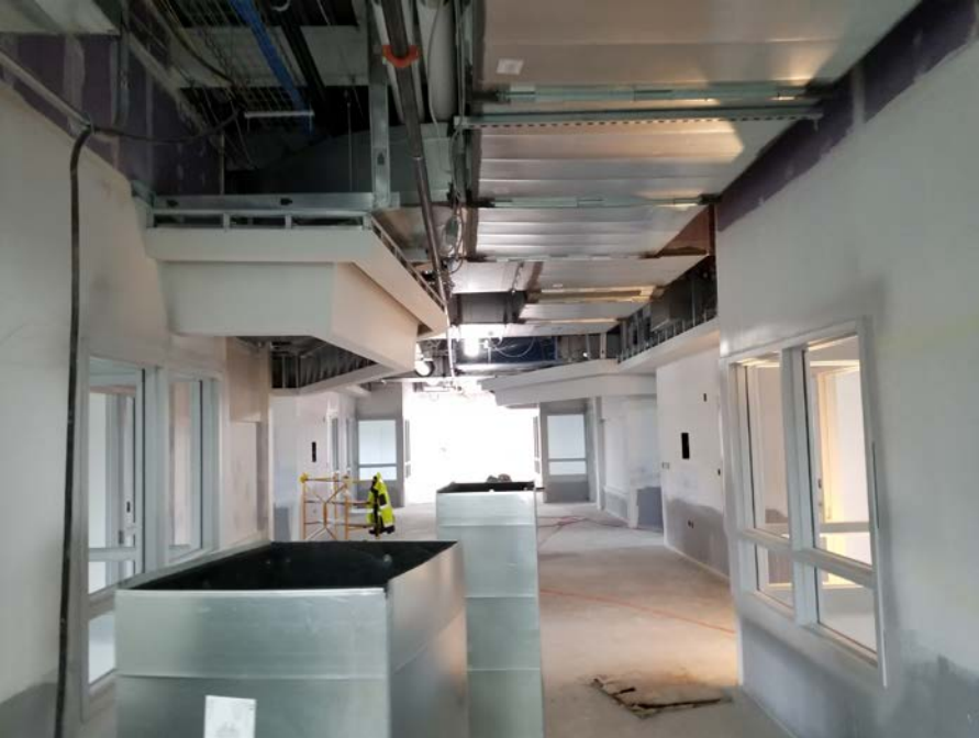
North Classroom Wing (upper level) – West Facing View; Drywall for soffit finishing, painting in progress