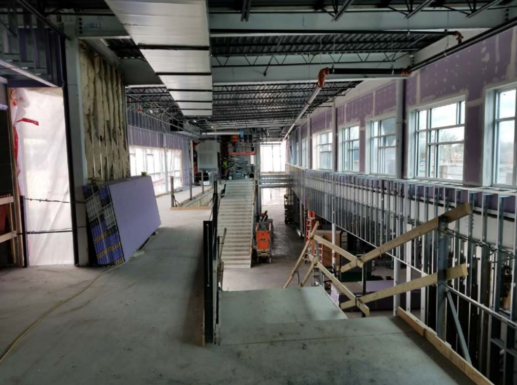
Grand Hall – North Facing View; Framing, mechanical, insulation and drywall install continues