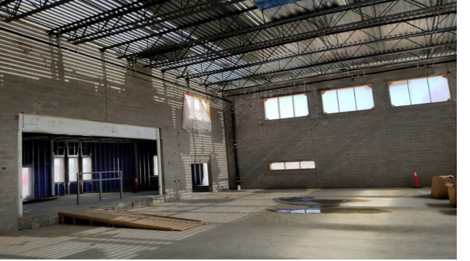
Gym - North Facing View; Windows and frames being installed