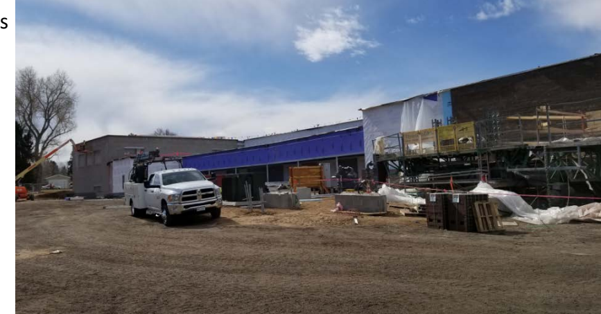
East Elevation – Brick, windows, and frames being installed