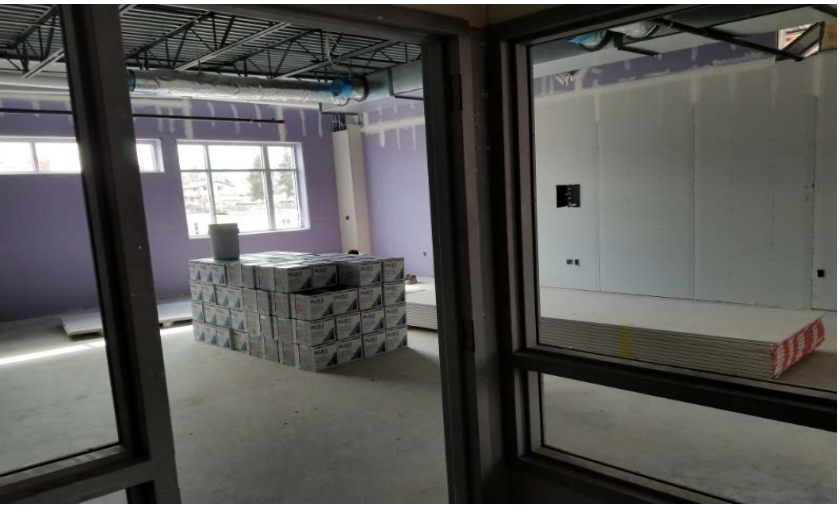
North Classroom Wing (upper level) – Classroom; Drywall and HVAC installed