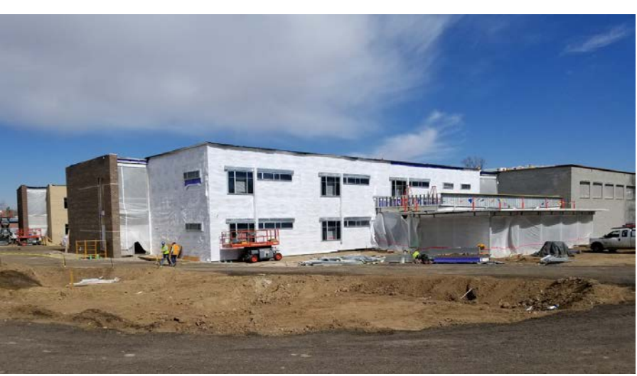
Front Entrance – Southwest Elevation; Windows and frames installed; Brick install; Roof and parapet installation continues