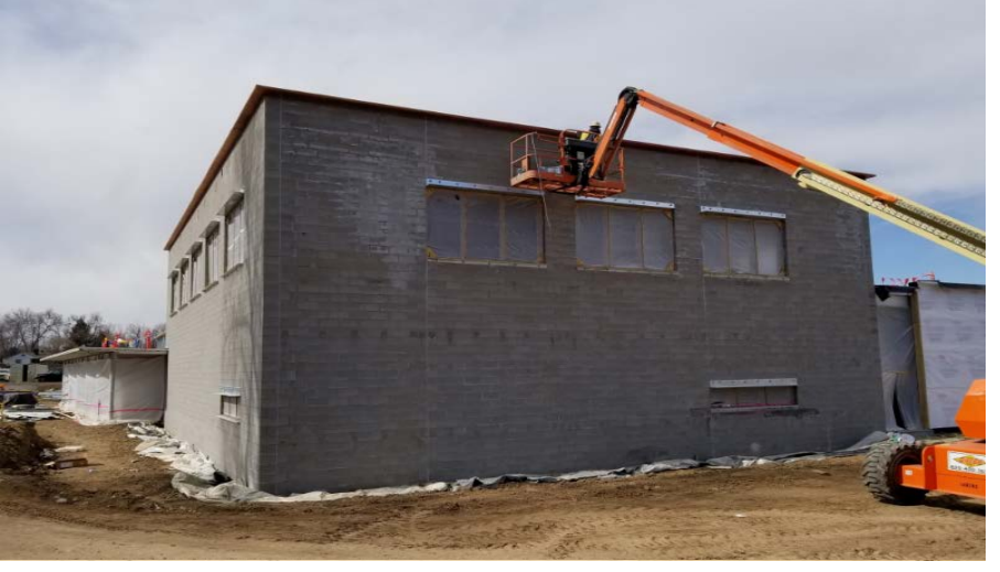
Front Entrance / Gym – Southeast Elevation; Brick, windows, and frames being installed; roof and parapet installation continues