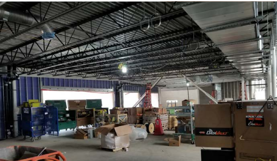
Learning Commons – South Facing View – Framing being installed

North Classroom Wing (lower level) -West Facing View; Drywall and insulation being installed