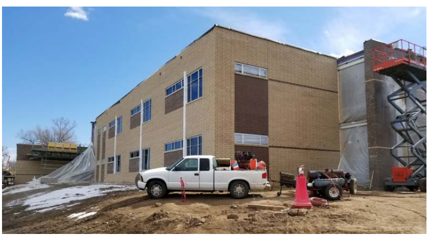
North Classroom Wing – Northwest Elevation; Brick, windows, and frames being installed.