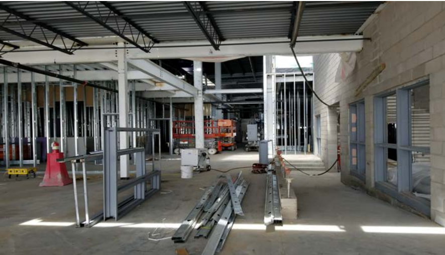
Grand Hall Main Entrance – North Facing View; Framing and HVAC being installed

Grand Hall – South Facing View; Framing and drywall being installed