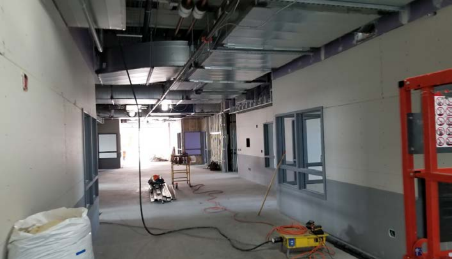
North Classroom Wing (upper level) – West Facing View; Drywall and HVAC installed; Framing for drywall soffit to begin