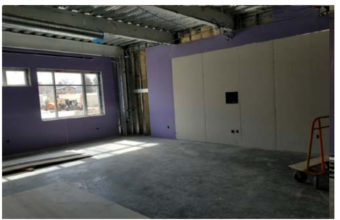
North Classroom Wing (lower level) -Classroom; Drywall being installed