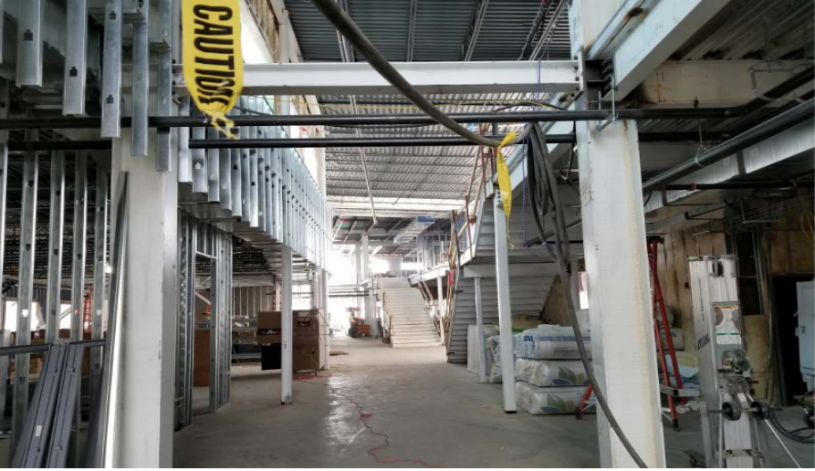
Grand Hall – South Facing View; Framing and HVAC being installed