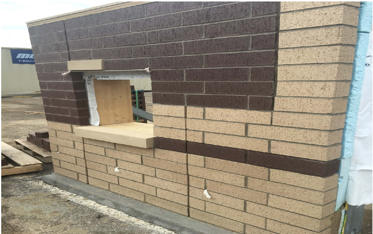
Brick Wall Mock-UP – Brick Installation begins 1/16/18