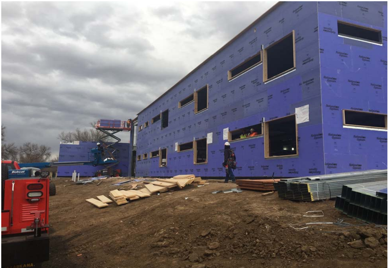
North Wing – North Wall