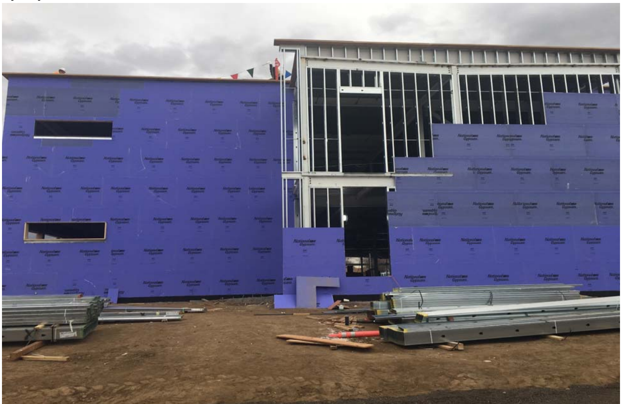
North wing – West view.