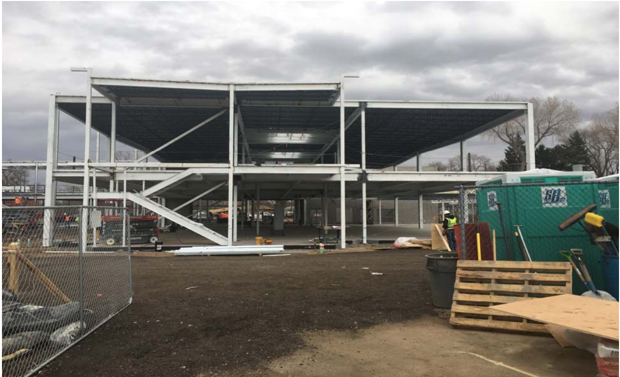
South Wing – Steel Erection and roof continue