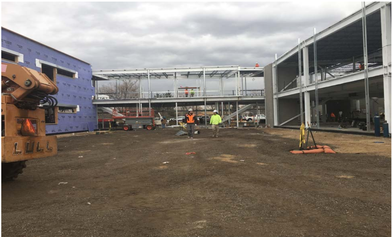
Center Courtyard – Steel Erection and roof continues