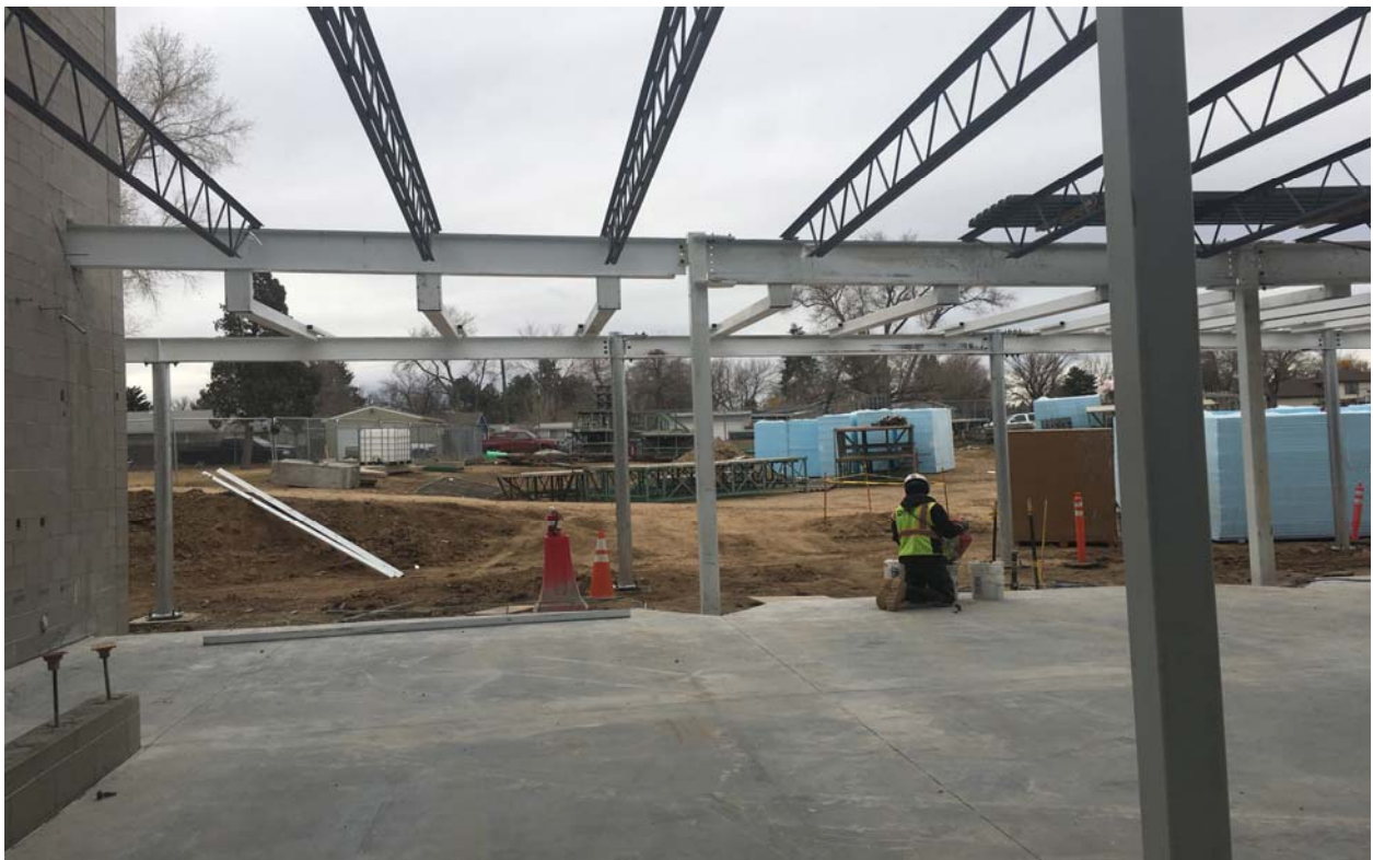
Interior View at Front Entrance – Looking out under Front Porch Canopy