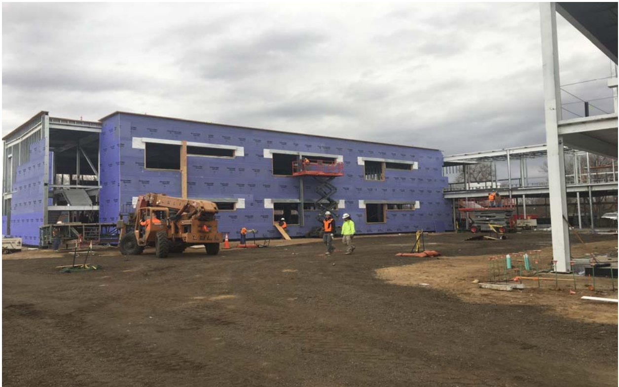
North Classroom Wing – view from courtyard. Exterior Wall/Window framing and insulation. Scaffolding be set in place in preparation for brick install 1/16/18.