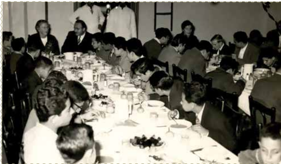
Christmas dinner for boarding school, 1950s