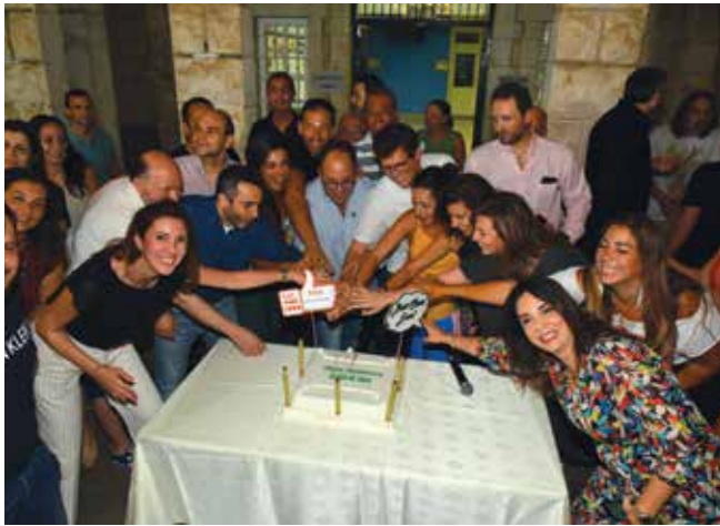
Class of 1994 August 10, 2019