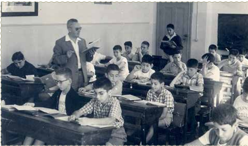
Students in classroom, 1950s