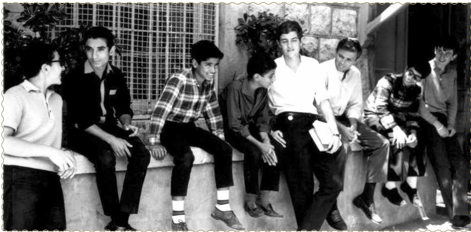
Boarding school students, Thomson Hall, 1950s