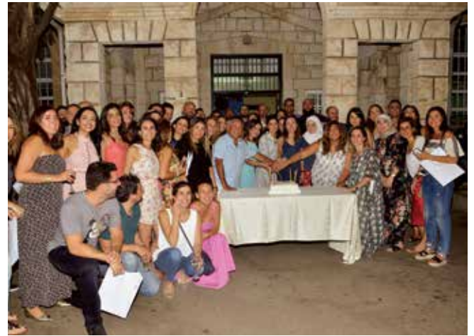
Class of 1999 July 12, 2019