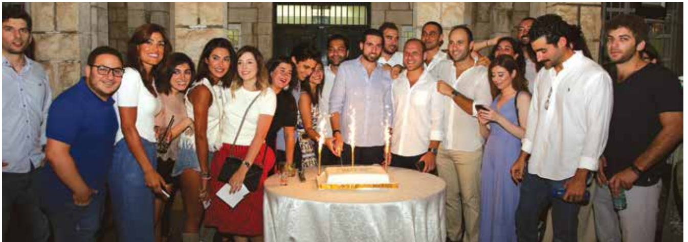
Classes of 2000-2018 July 6, 2019