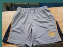
Grey Athletic Shorts