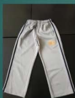
Grey Athletic Pants