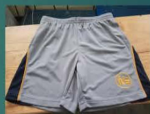
Grey Athletic Shorts