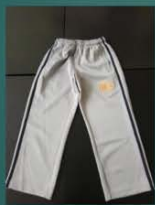
Grey Athletic Pants