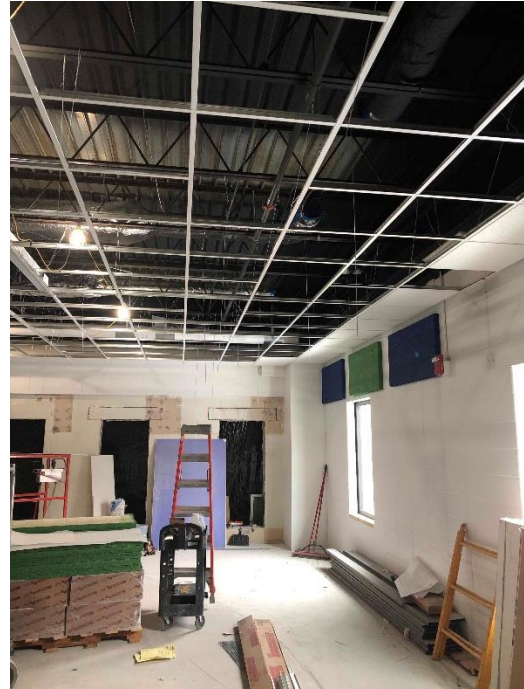
SFMS Cafeteria Expansion Ceiling Grid