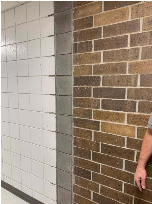
EBES masonry repairs