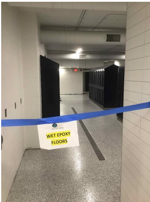
SFHS Area C locker room epoxy flooring