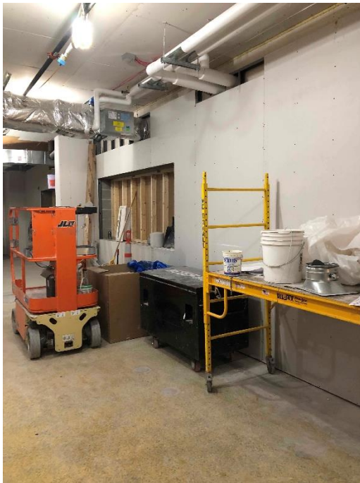
SFMS Area B Fitness Room Drywall