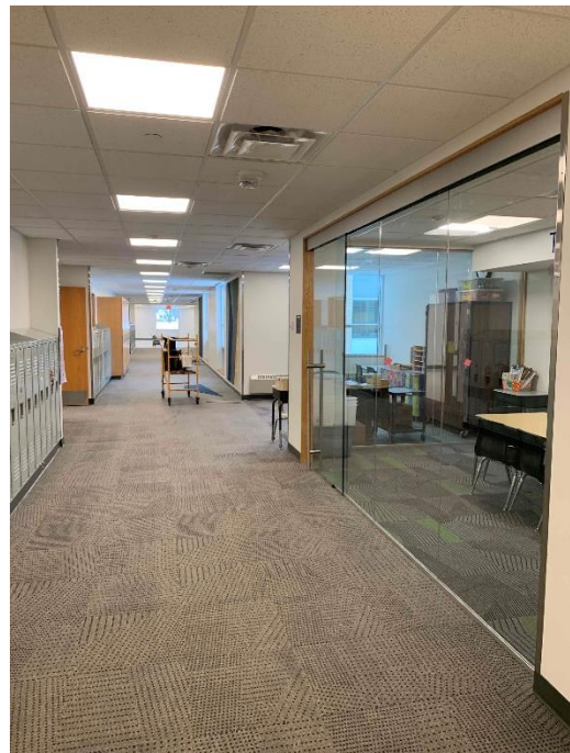
SFES Addition Flex / Conference Space