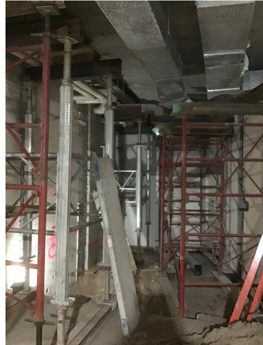
SFHS Band / Choir Shoring