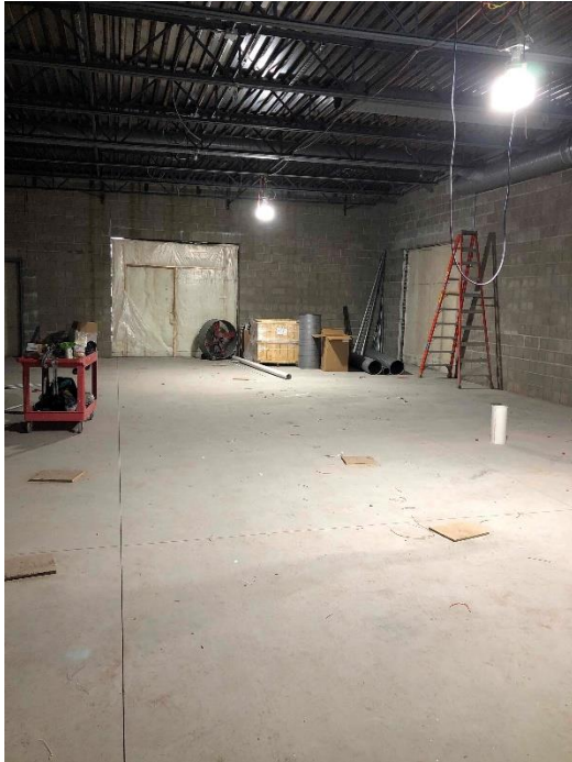
SFHS Band / Choir Area