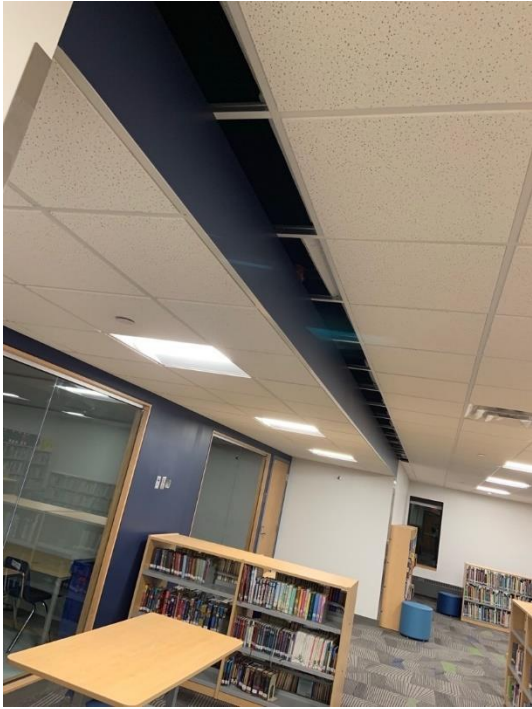
EBES ceiling repairs