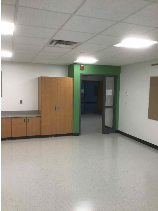
SFES Typical Classroom in Addition