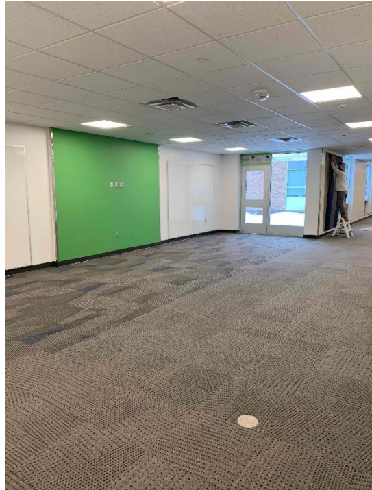
SFES Addition Flex Resource Area