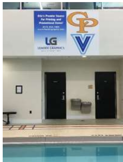
Pool Banner 4' (W) x 6' (H)