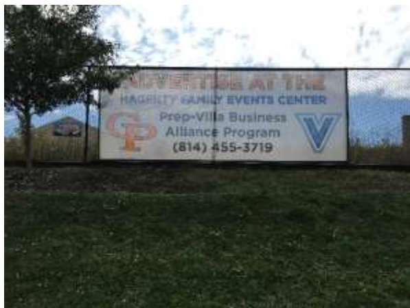
Dollinger Field Sign 19' (W) x 7' (H)