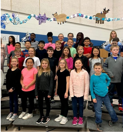
4th/5th grade Music Concert