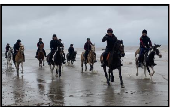
Year 8's having a blast along the beach