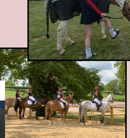
May fun at the NSEA Eventers Challenge at Hickstead