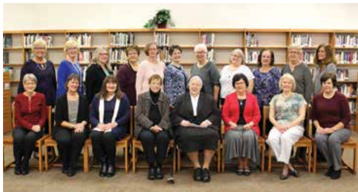
45 Year Reunion - Class of 1972 reunion on November 4, 2017