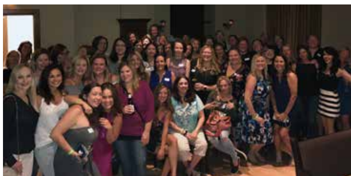
20 Year Reunion - Class of 1997 reunion on August 11, 2017