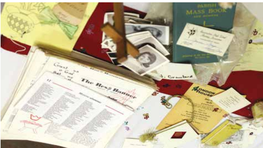
Members of the Class of 1967 brought mementos to share with classmates.