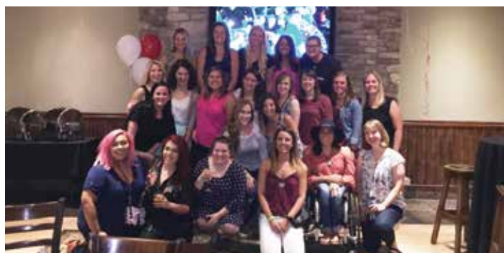
10 Year Reunion - Class of 2007 reunion on September 16, 2017