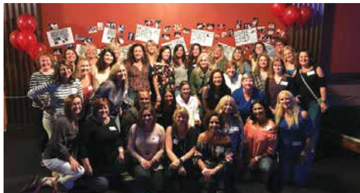
30 Year Reunion - Class of 1987 reunion on September 9, 2017