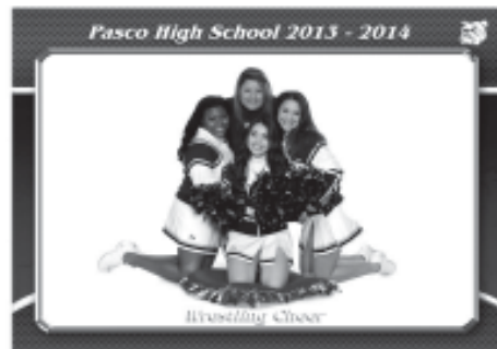
Funny Team Print

Please complete if you are requesting completed order to be mailed.