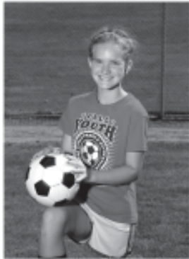
5x7 Player Print