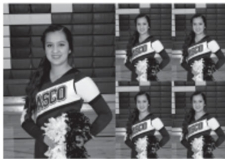
5x7 and Wallets Prints of Player