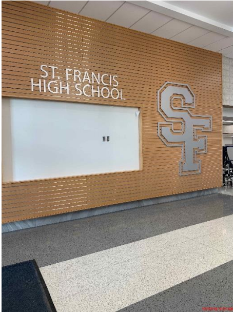
Progress Photo: SFHS Front entry sign and school logo installed