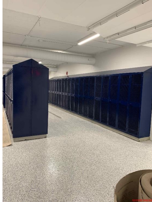
Progress Photo: SFHS Girls Varsity locker room lockers installed