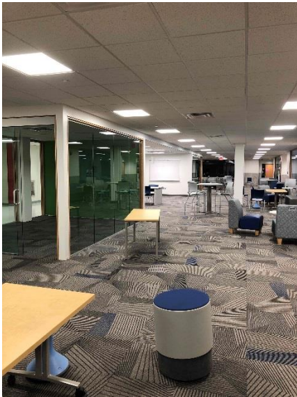
Progress Photo: Furniture moved to upper L