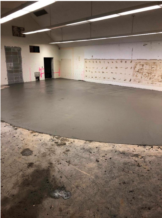
Progress Photo: SFHS Chior room cement poured