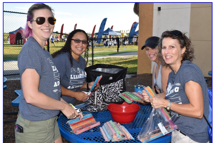
PTSO volunteers open popsicles to cool off Fun Runners.