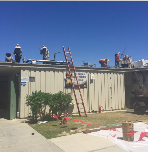
TOW Roofing Replacement