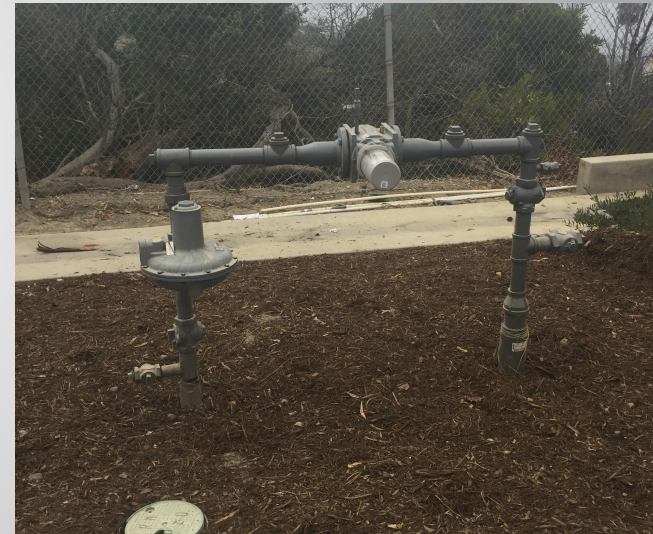
Thurston has GAS!!!