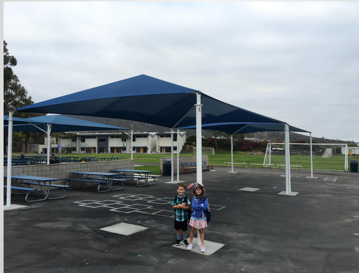
New Shade Structures at El Morro