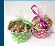
S'mores Snack Mix