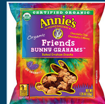
Organic Bunny Grahams