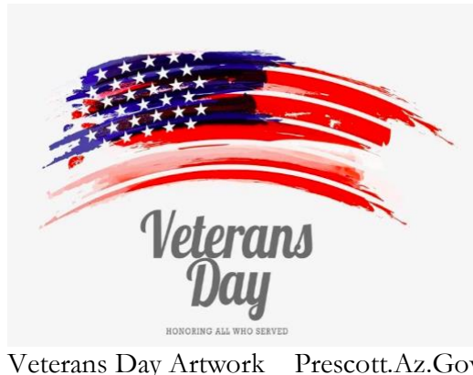
Veterans Day Artwork Prescott.Az.Gov

The first Thanksgiving ever was organized by the pilgrims and Native Americans in the spirit of the fall harvest. A large, social banquet was held with that year's gatherings and everyone feasted. Other countries also have holidays similar to Thanksgiving as well though. Korea, for example, has a celebration called Chuseok which is a time for a family to gather and is celebrated with the preparation of authentic food. It is also held in celebration of the harvest. One of the dishes served is Songpyon, which is a rice cake with sesame seeds, chestnuts, red beans, and other delicious fillings. China also has a similar ceremony called the Chinese Moon Festival. This is a special celebration and often is held with families. Moon Cake is one of the foods that is eaten and is made to resemble the full moon in the sky. These are just a few examples of Thanksgiving in other countries and there are many more traditions in our diverse community alone.