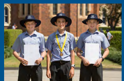
Top Geography Results