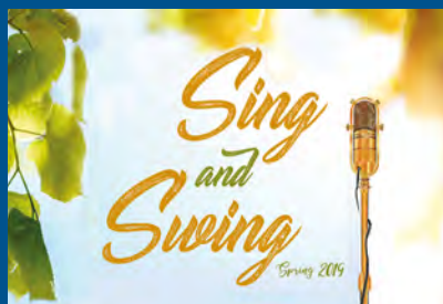
Outdoor Music Concert