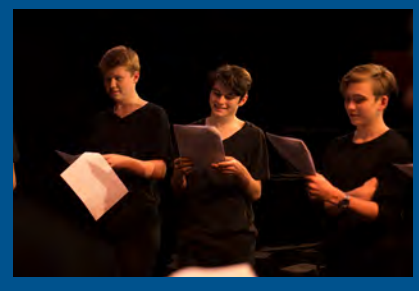
Junior Dramatic Production