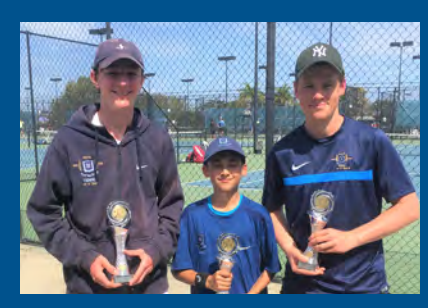
State Tennis Tournament