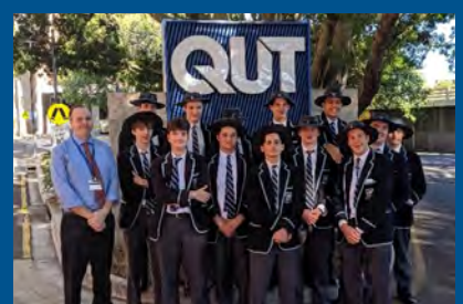
QUT Science Excursion