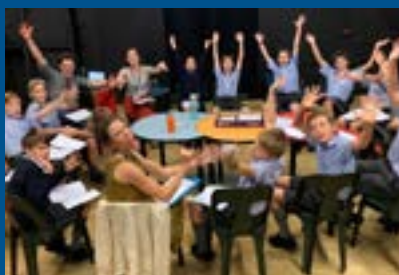
Middle School Drama