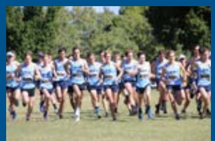
Cross Country training