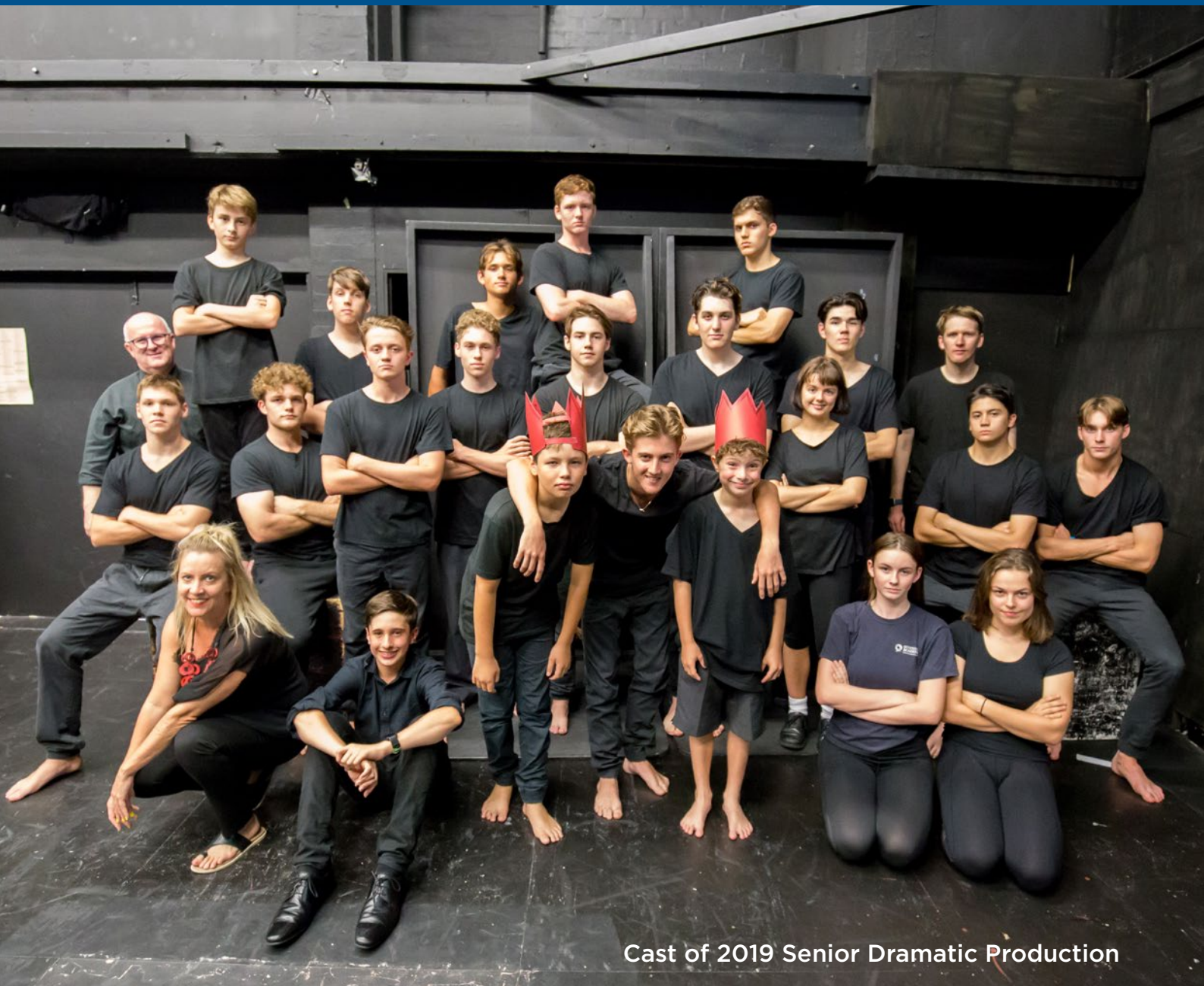
Cast of 2019 Senior Dramatic Production