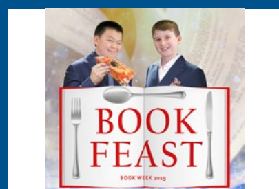
Book Week celebrations