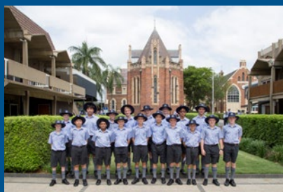
Middle School Captains