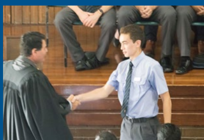
2019 Prefect Induction