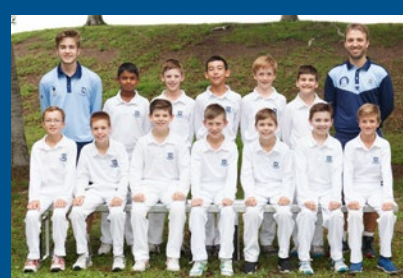
Middle School sport