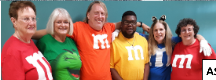
ASEP staff celebrated Halloween in style. NHES staff was M&M's and MES celebrated the 1970's.