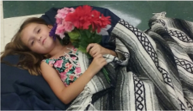
Right: NHES celebrates the super hero in all of us for red ribbon week.