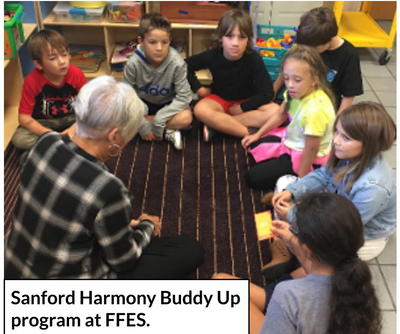
Sanford Harmony Buddy Up program at FFES.