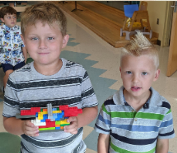
Above: Magnetic blocks are a favorite at CHES. This is a baby calf.