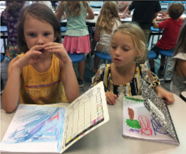
FFES girls are working on their journals as part of the daily quiet time activities.