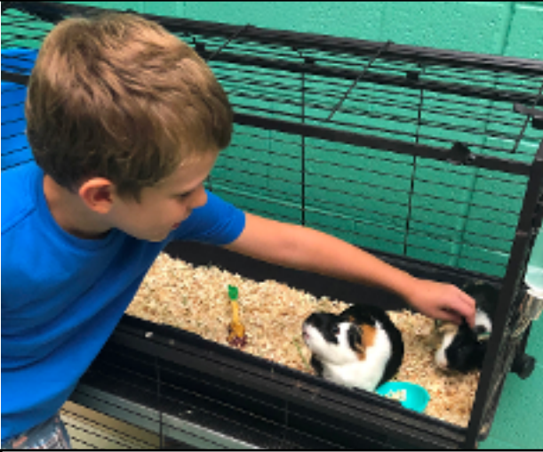
Introducing GiGi and Cinnamon at MES!