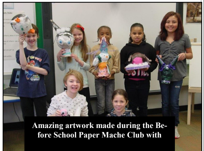
Amazing artwork made during the Before School Paper Mache Club with

We have had so many wonderful enrichment activities already this year and more to come. Some activities so far have been when Fitch High School students came to CC to work with our students in grades K-5 during the Hour of Code. CC students learned how to move figures and robots using basic computer codes. Coding helps develop and enhance math skills, executive functioning, and problem-solving. It was a wonderful partnership experience and opportunity for our students. NESS (New England Science and Sailing) will also be coming to CC to support NGSS Standards (Next Generation Science Standards) through hands-on experiments and the Science Center of Southeast CT will be coming for STEM activities for Kindergarten and Grade 1 students. In addition, we have partnered with Grasso Tech National Honor Society. A group of 15 students came and will continue to come this year to CC to work with students in classrooms, out at recess, and in the CC Garden.