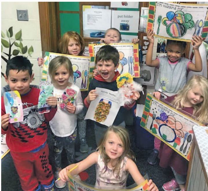
Students with placemats

All of the Young 5 students are preparing to host their families for a Family Feast Brunch to celebrate family and friendships. There will be music, a story, and of course...a tasty feast!