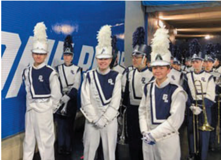
Drum Majors at State