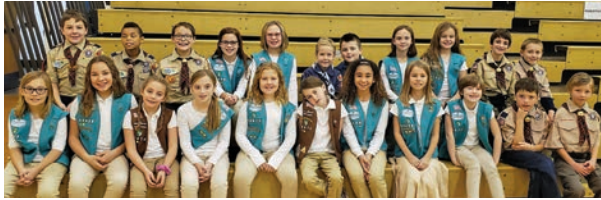
Brownie Troop #80475, Girl Scout Troop #80438 and Boy Scout Troops #294 and #296