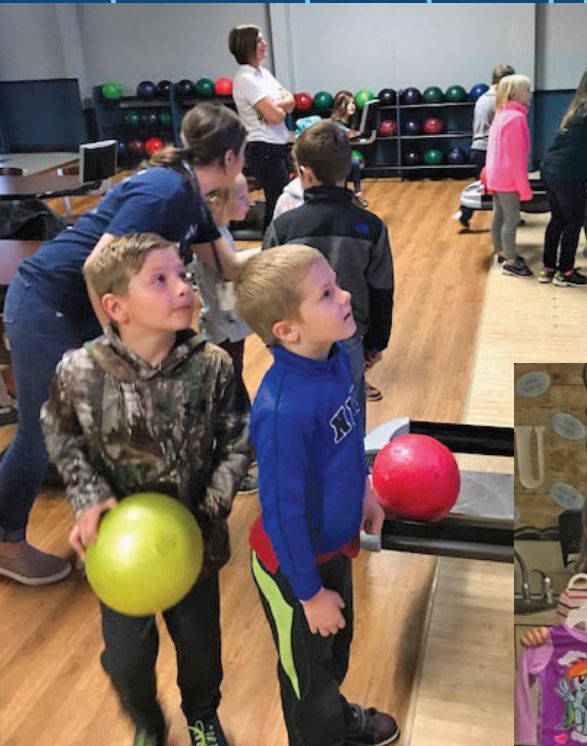
1st Graders Bowling

Thanks to the Gull Lake Community Foundation, Kellogg Elementary first graders took a trip to Richland Lanes in October. The trip was a great culminating activity to end a two-week bowling unit they participated in during Physical Education class.