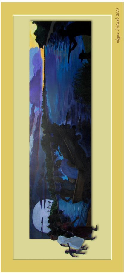
Lagos School 2010