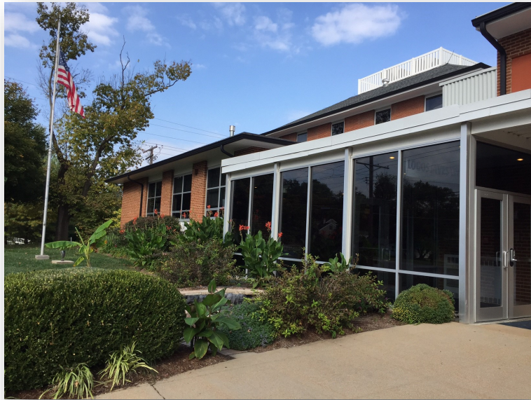
Front of School