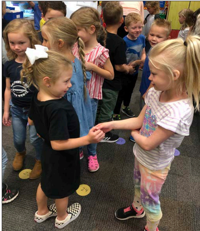
Kindergarten students at South Weber Elementary learn the importance of eye contact as they greet other students.

Both South Weber and Hill Field are focus schools in the district's emerging SEL program, which means