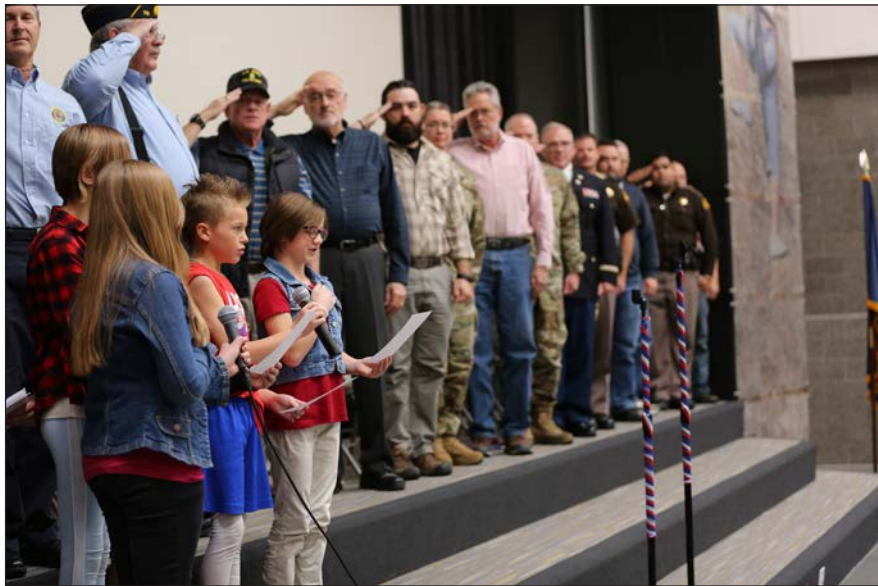
Students sing the National Anthem to honor the visiting veterans. Family members who served in the Armed Services were invited to the Veteran's Day program.

Many Veteran's Day programs were held throughout the district. They varied from lunches with veterans, flight-simulator demonstrations, musical assemblies and historical presentations.