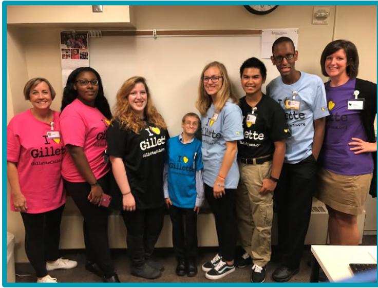
Preparing young people with significant disabilities for success in integrated, competitive employment

Through a partnership with Project SEARCH, Gillette Children's Specialty Healthcare helps young adults with intellectual and developmental disabilities find competitive work by providing internship opportunities within the hospital and clinics.