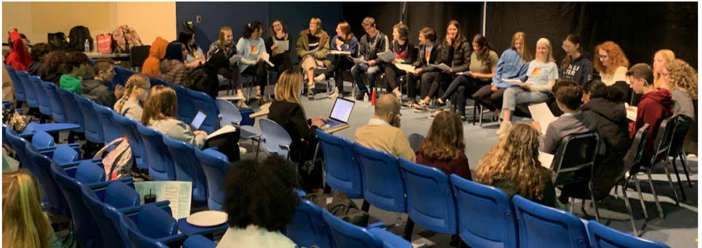
During the third block on Wednesday, November 20, No Place For Hate invited students to participate in a Fishbowl forum, the topic was Mental Health.