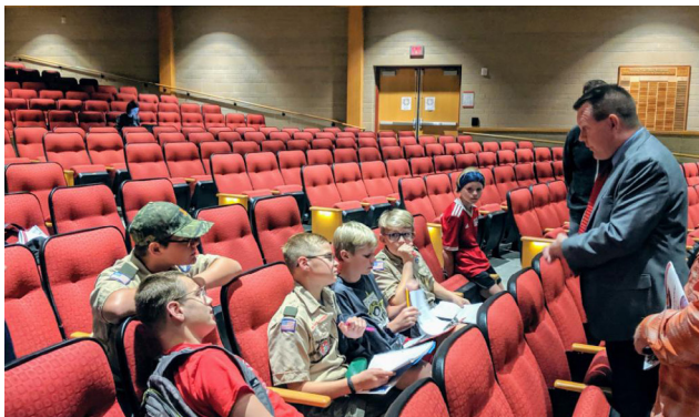
Board Members explaining their role in public service to a group of boy scouts who attended our Annual Meeting.