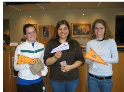
And the winners are!